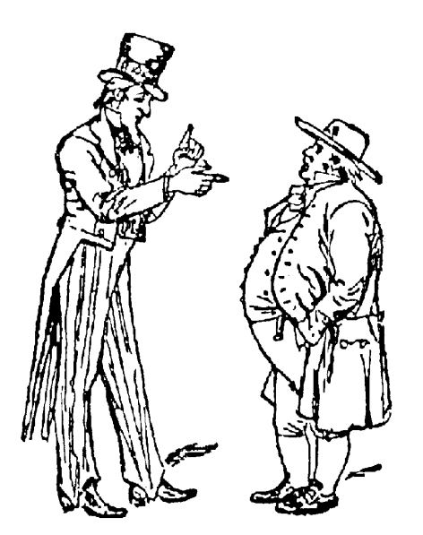
UNCLE SAM & BROTHER JONATHAN