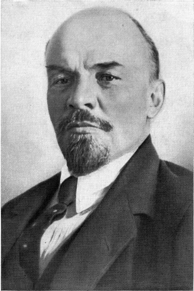
V. I. LENIN 1918