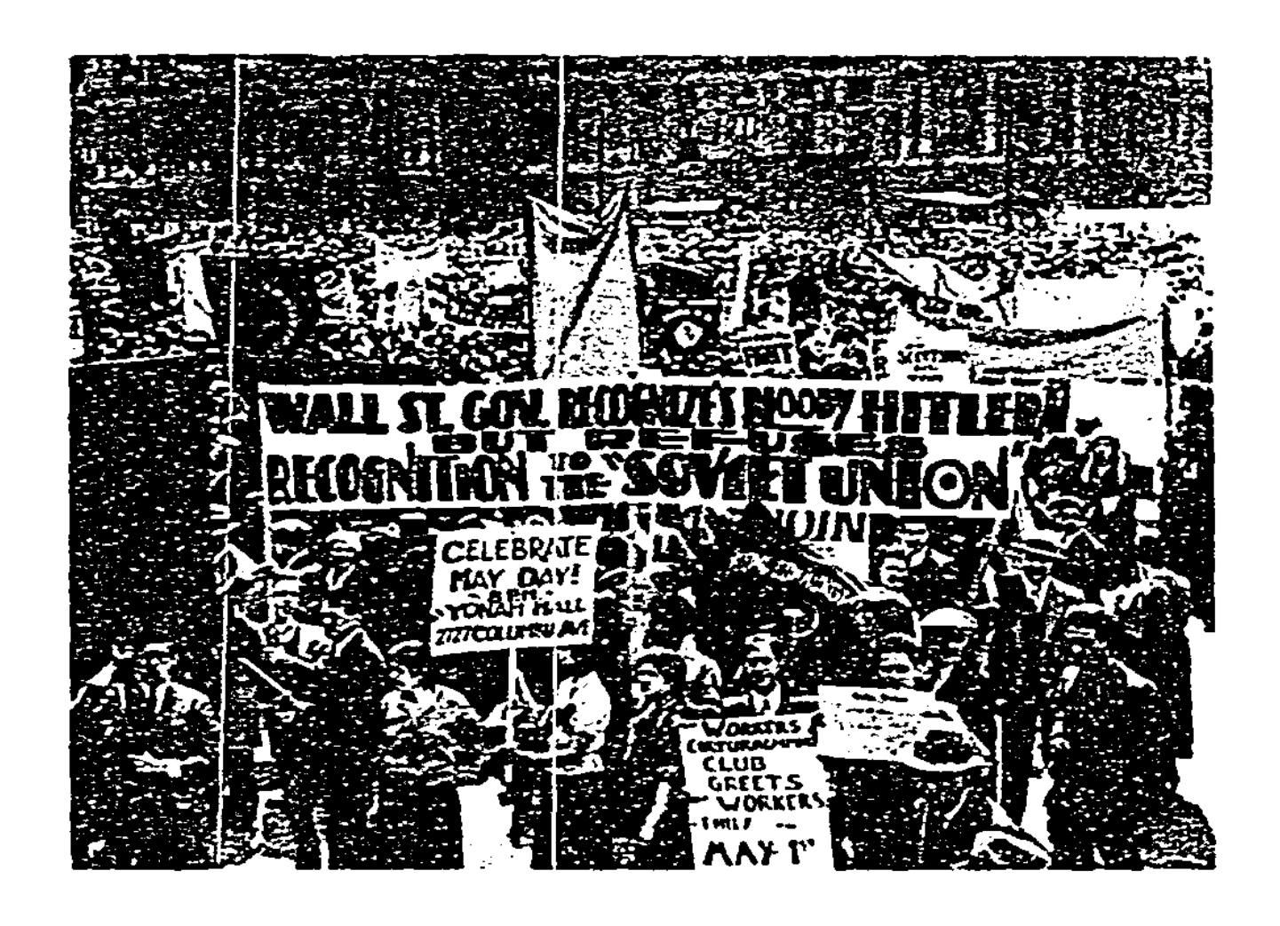
Communism in America: Above, May Day demonstration in front of Philadelphia's City Hail in 1933. Below, office of The Daily Worker, New York, shortly before Federal seizure in 1956.