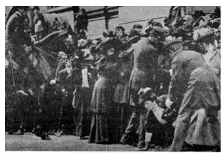
The bold role of women in organizing the garment unions and confronting the bosses and cops shows that they are not the "weaker sex."

Some would argue that, even though women are clearly oppressed and exploited under capitalism, societies which sup-