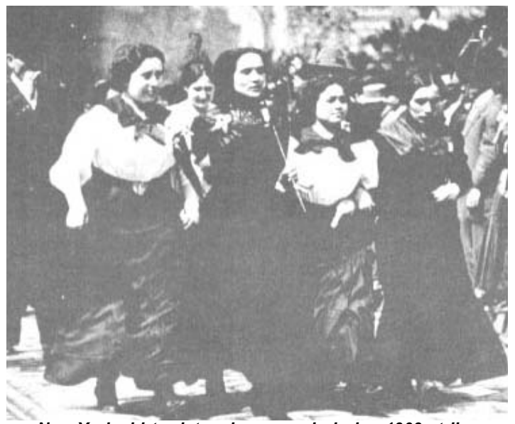
New York shirtwaist-makers march during 1909 strike. 30,000 women beat bosses and sellout union leaders, and succeeded in organizing the union.

members of PLP. Sexist behavior will not be tolerated in the ranks of the revolutionary movement we are building. Any man who considers himself a fighter for the working class is practicing complete hypocrisy if he does not participate fully and equally in the domestic production taking place in his own home every day. To lift a hand in violence against a female member of his class is, moreover, to commit a counterrevolutionary act.