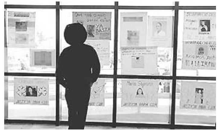
In Juarez, Mexico since 1993, over 320 women have been been found raped and killed in this bordertown. A man above looks at some of the posters of the missing.

Some might concede that male violence against women both reflects and strengthens a hierarchical and coercive social order. But they might nonetheless maintain that men benefit from women's subordination. After all, they generally make higher wages than women. While it is true that in different parts of the world women make somewhere between 50% and 75% percent of what men earn, this does not mean that men gain from that differential. Men's wages are held down precisely because women's are especially depressed. If a woman makes $3.60 a day sewing baseballs for Rawlings in Haiti, it makes it all the easier for other U. S. -owned Haitian industries to hire men at, say, $4.50 a day; the few elite