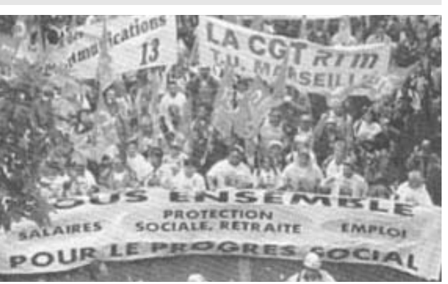
Paris, May 2003—Workers march against attack on their pensions,

France sent more troops, but instead of stopping the mass murder, they helped protect Europeans and the Hutu organizers of the genocide, getting them out of the country ahead of the FPR. The U. S. government helped the massacre, too, by opposing U. N. Security Council intervention, even after the reality of genocide had become widely known. Why should these imperialists bother to stop the killing? As French Pres-