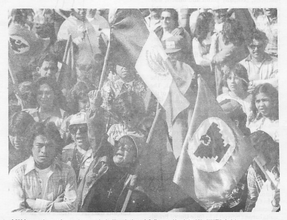
3,500 farm workers and supporters marched militantly through Salinas on March 4, 1979.

The murder of Rufino Contreras has not dampened the fighting spirit of the farm workers. A 51 year-old woman striker from Salinas declared to UNITY , "Farm workers have always paid with blood for any improvements we make; now we're more determined to win the strike."