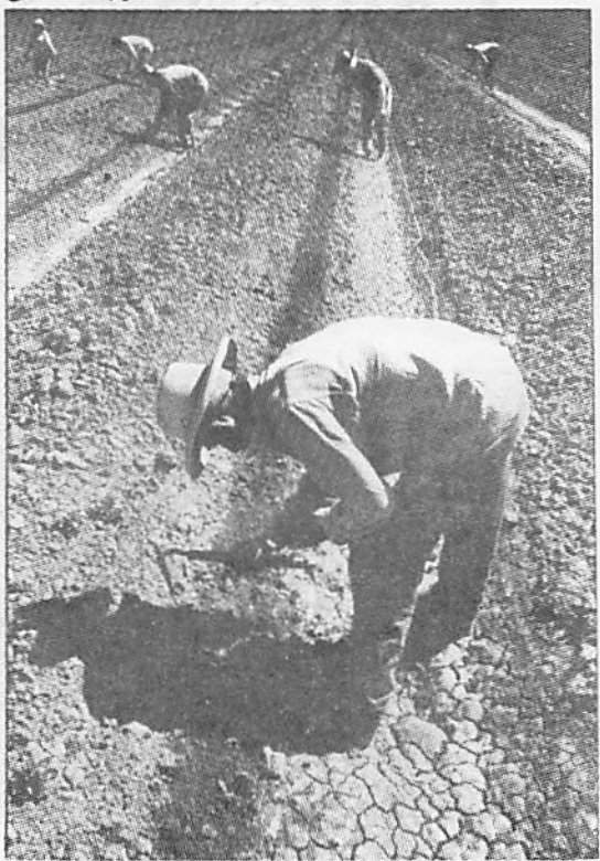
Farm work is among the hardest in the U.S. Here, farm workers must work stooped over all day clearing a field.

Even with unionization, the farm workers have had to fight the combined forces of the growers, police, courts and the leadership of the