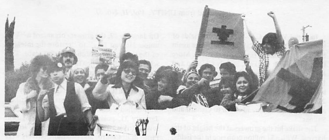
People and groups from all over California and the Southwest are coming together to support striking farm workers. Here, supporters arrived in a car caravan from San Jose, California.

The whole Chicano national movement should unite around the issue of support for the farm workers. Chicano workers, student organizations and community groups should join in a united and coordinated effort of sup-