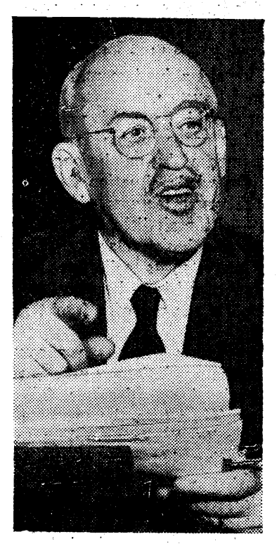
SEN. RALPH E. FLANDERS

The present relationship of forces between Democrats and Republicans in Congress is very close in both the Senate and the House. The Democrats are obviously depending on the usual