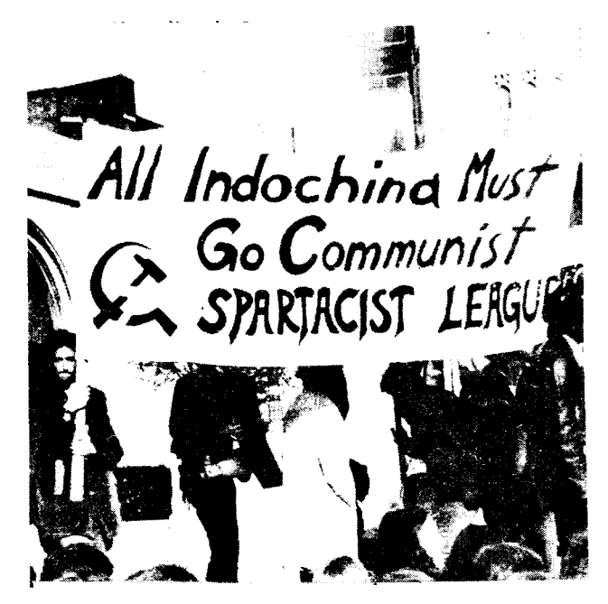
Spartacist/RCY supporters at SDS convention.

Less than three years ago, the Worker-Student Alliance caucus led by Progressive Labor confronted the New Left leadership of Students for a Democratic Society over the crucial question of the working class and, after a deep split in the ranks of SDS, emerged as the leading tendency. In the intervening period, against a background of growing working-class militancy and the sharpening of the international crisis of capitalism, the PL/SDS leadership has moved steadily rightward in rapid retreat from the subjectively revolutionary pro-workingclass line which had won it hegemony over the radical student organization. The Spartacist League and Revolutionary Communist Youth (formerly Revolutionary Marxist Caucus) consistently fought to reverse SDS's rightward motion and make SDS a non-exclusionist socialist youth organization with a Marxist workingclass program. At SDS's second National Convention since the 1969 split, held March 30-April 2 at Harvard University, RCY led the fight against the SDS leadership's new single-