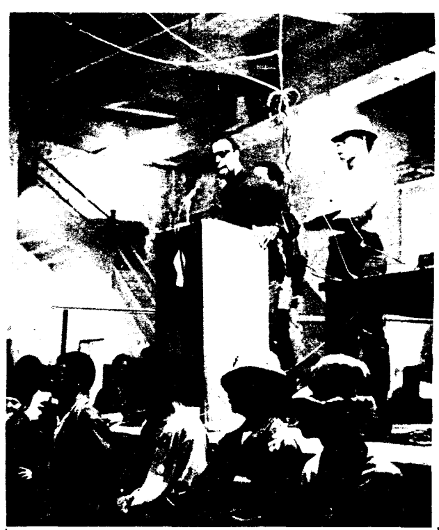
Panthers at '69 SDS convention call PL "racist" for stressing class line, opposing black nationalism. PL now abandons class line for SDS, capitulates to reformism.

At the root of the reformist content PL gives to the slogan of a worker-student alliance is an inability to grasp the Leninist insistence on the leading role of the industrial working class in the socialist revolution. The working class--by virtue of its role in production, the collective and cohesive social organization of its work, its existence as wage slaves rather than proprietors (small or large) of land or capital -- is the only inherently revolutionary class in capitalist society. The petty bourgeoisie stands tangential to capitalist production, and its social position is highly unstable. In times of crisis, the petty bourgeoisie in its main motion supports whichever major class--bourgeoisie or proletariat-offers the greater social stability. The critical