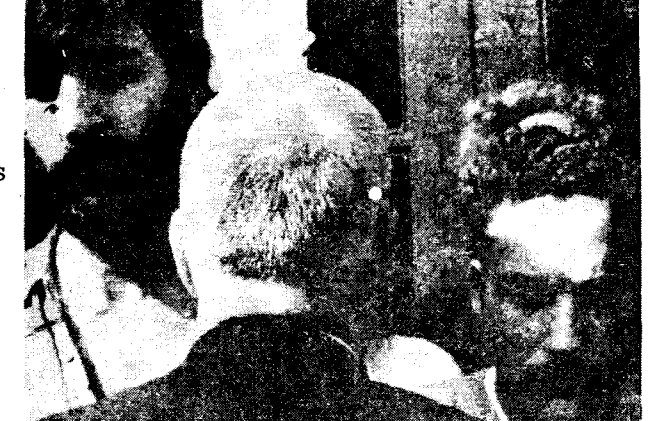
RCYers, other strike militants bar President McGill from Hamilton Hall, Columbia.

The liberal defenders of imperialism are quick to seek to turn the revulsion against Nixon's reescalation to their own advantage. Bella Abzug, for example, rushed up to Columbia in an attempt to rally the striking students around her electoral ambitions. The elementary duty to exclude the