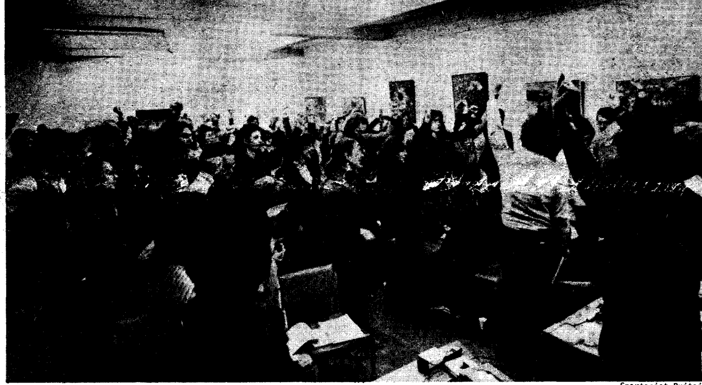
Singing the 'Internationale' at the Spartacist League founding conference.

The goal of our regroupment policy has always been to decisively split the cadre of centrist organisations, in the first instance the Pabloist pretenders to Trotskyism who are the principal obstacle to reforging the Fourth