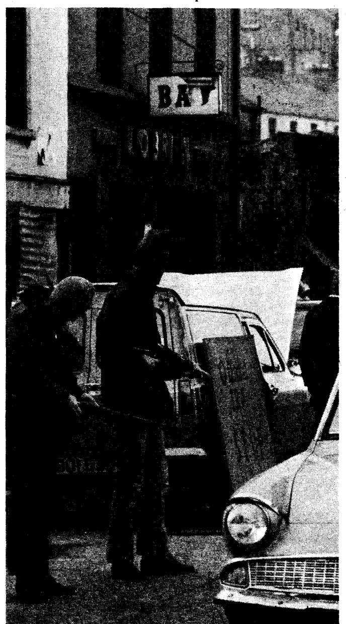
IRA checkpoint in the Bogside in Derry, 1972

The Belfast industrialists took control of the Orange movement and the opposition to Home Rule with the Ulster Convention of 1892 (for which the Organising Committee had prudently ensured an urban preponderance among the delegates). At the Convention the Belfast bourgeoisie succeeded in taking the mass base from the landowner-aristocrats and placing it under the banner of something akin to an Ulster nationalism. To dampen any suggestion of frivolity, women were excluded altogether from the proceedings of the Convention and the floor of the pavilion was sanded in