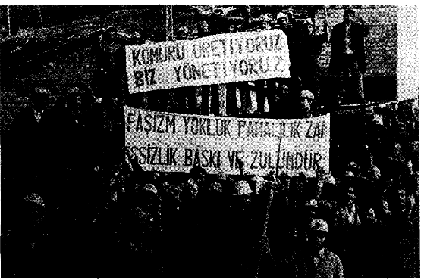
Miners strike in Askale, Turkey, October 1977.

Thus a key task for revolutionaries in Turkey is to