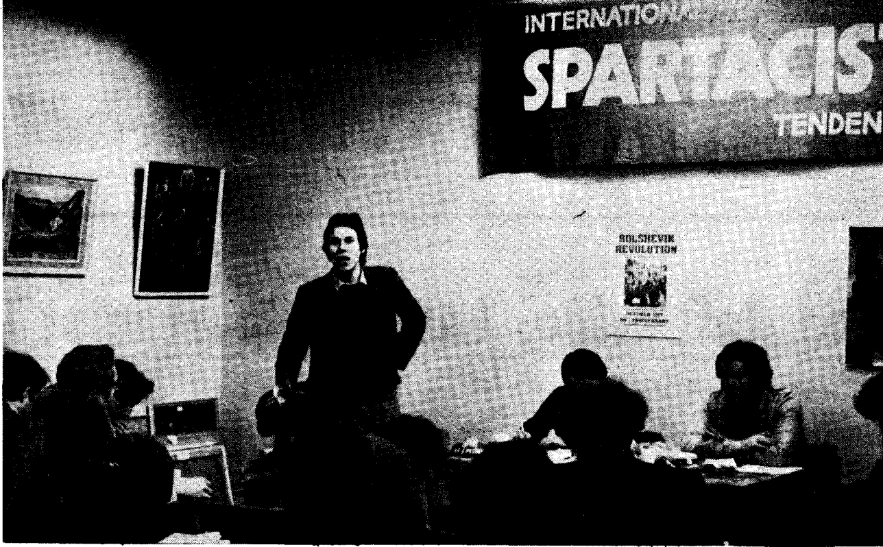
Founding conference of the Spartacist League.