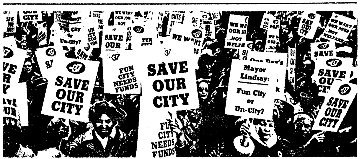
DC37 (AFSCME) WORKERS PROTEST BUDGET CUTS

front can NMU members escape the double trap of their declining industry and treacherous union leadership. This is why the program of Morrissey's "Committee for NMU Democracy" is fundamentally deficient and even dangerous. For once the seamen have waged an all-out struggle to unseat the Curran machine, it may be a decade before they are prepared to undertake such a fight again. The Curran machine stands nakedly revealed as corrupt, despotic and conservative; to topple it only to raise in its place a "good guy" leadership which does not differ from Curran on fundamental class questions would be a gigantic betrayal of all NMU seamen.