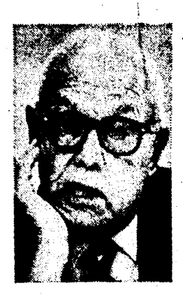
George Meany, head of A.F.L.-C.LO., backed the use of anti-inflationary wage and price controls.

will be the first to call for smashing the unions themselves, and sending American labor back into the conditions of the last century.