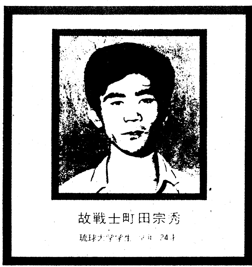
Machida Munehide - Murdered by Stalinists