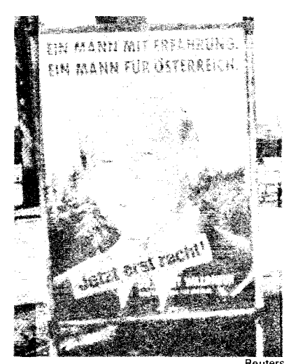
Waldheim campaign poster. Sticker says, 'Now more than

The following article is reprinted from Workers Vanguard no 404 (23 May), fortnightly 'paper of the Spartacist League/US. Waldheim has since been elected president of Austria by