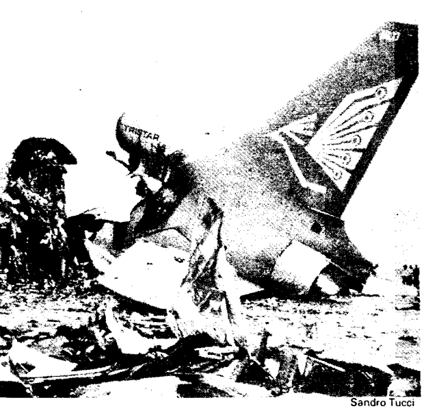
Tamil nationalist group now claims 'credit' for blowing up Air Lanka jet filled with tourists.

As against the despairing perspective of nationalists, for whom guerrilla counter-terrorism and eventual Indian invasion represent the only logical programme, we fight for the perspective of revolutionary class