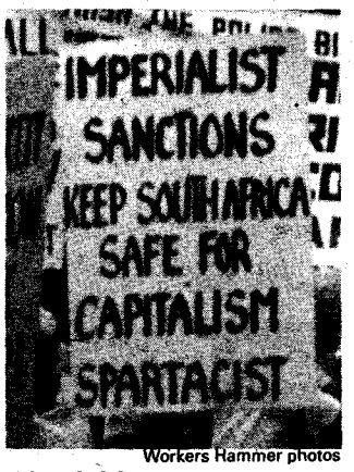
Centrist Workers Power provides 'left' cover for imperialist sanctions. Trotskyists insist sanctions are aimed at keeping South Africa safe for capitalism.

trol!'. That's the message. Whether it comes from Reagan (remember 'constructive engagement'?) or from the sanctimonious sanctions people in Congress, the message is the same, to save South Africa from the civil war it so desperately needs.