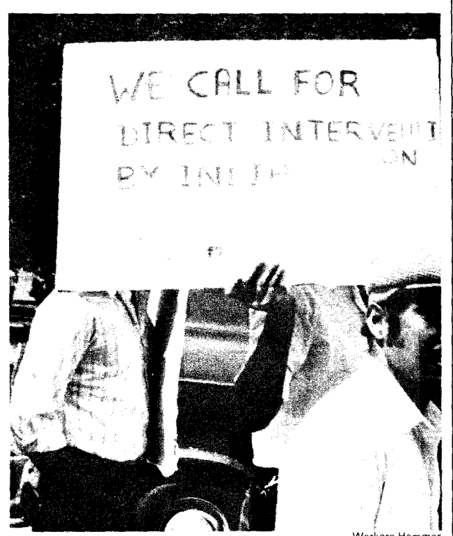
Tamil demonstrators in London appeal for help to capitalist India.

Some of the ugliest incidents have occurred in the course of the bloody internecine warfare among the Tamil organisations themselves. As many as 300 Tamils were killed in recent fighting between the Liberation Tigers (LTTE)