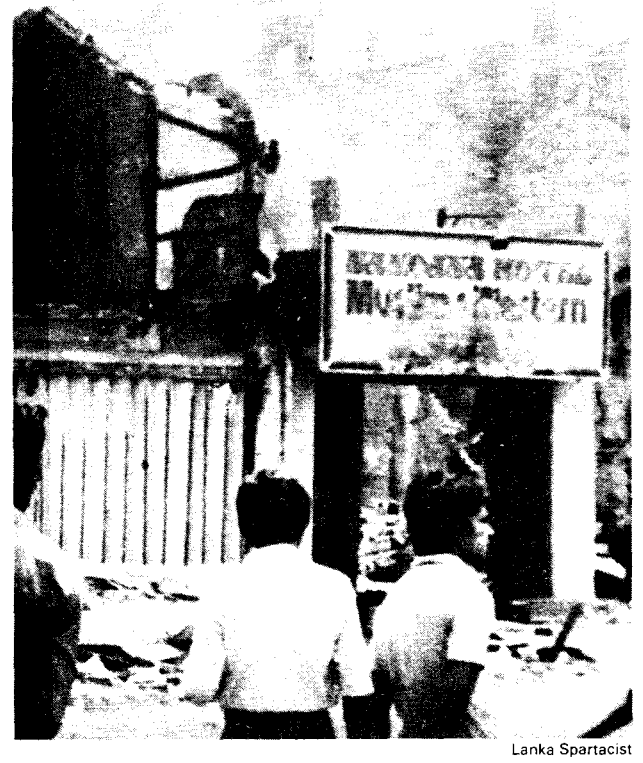
Colombo, July 1983: Government-instigated pogroms slaughtered hundreds, burned Tamil-owned shops to the ground.

Jayewardene, having devoted months under a fictitious 'cease-fire' to pacifying the Eastern region and building up the military, moved on the North with the intention of finally crushing the Tamil resistance and wiping out their cadres. The openly pro-US regime appeals to 'the English-speaking world' to help 'suppress the alarm and rebellion here' (Sunday Times, 11 May), and the imperialists have obliged. The Sri Lankan army is now equipped with 150 armoured personnel carriers from South Africa, 21 US-built helicopters, six Marchetti planes from Italy, as well as 50 patrol boats and some 40,000 land mines (Asiaweek, 1 June). British and Israeli