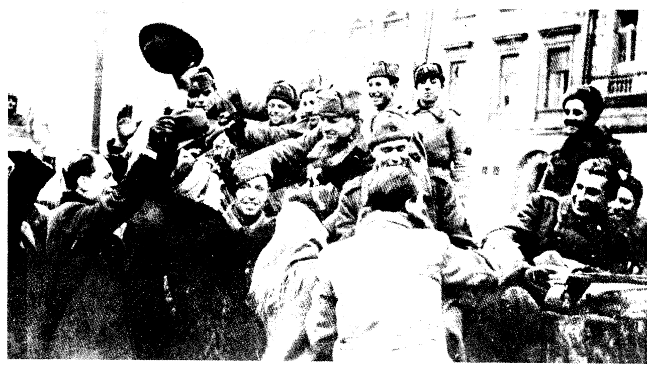
Polish masses welcome Soviet liberation from Nazi terror.

So, I would like to make the point there is a different tradition in Poland, there is the tradition of Rosa Luxemburg, there is the tradition of the Polish Communist Party in the early 1920s, which fought against Pilsudskiism. That's the tradition of Polish Trotskyism — it's the fight for the unity of the Russian and Polish proletariats. Political revolution is counterposed to capitalist restoration, it's counterposed to Solidarnosc.