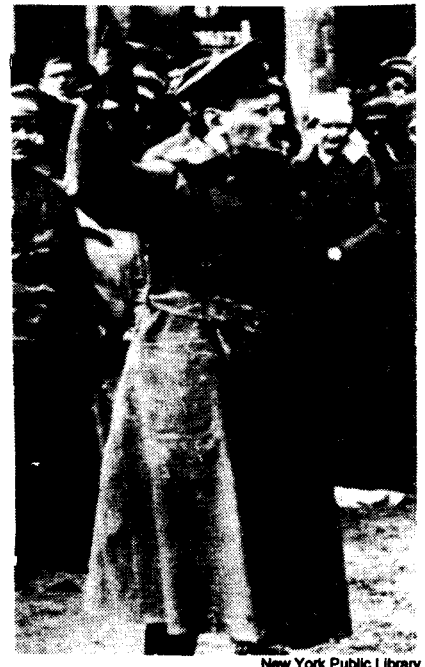
Leon Trotsky, co-leader of the October Revolution and founder of the Red Army.