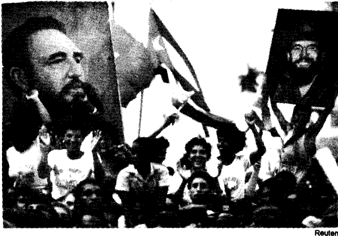
Where Norden's appetites wandered: to geriatric remnants of former East German Stalinist bureaucracy now in social-democratic Party of Democratic Socialism, and to Castro's Cuba.

time, he continued to submit bills for all other material he felt he needed for whatever political work he was doing.