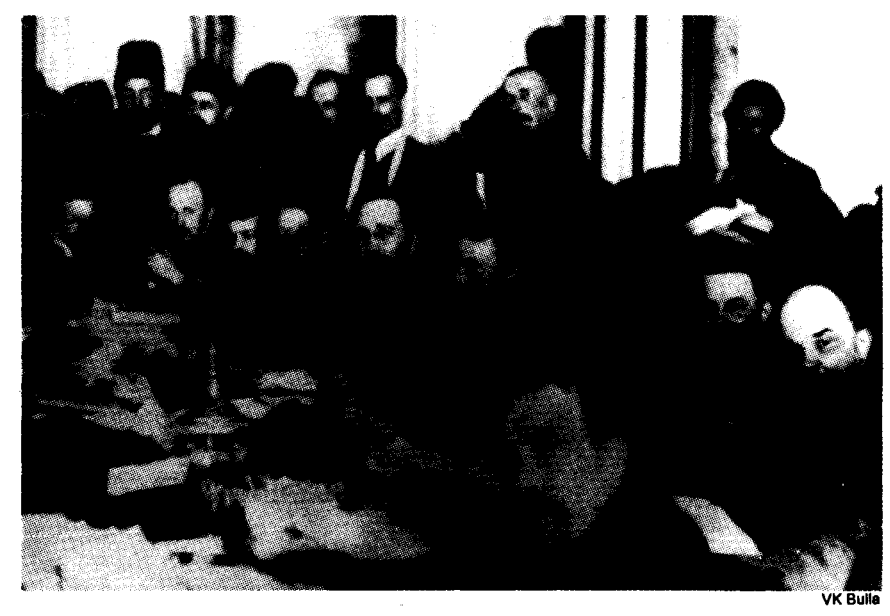
Presidium of the Ninth Congress of the Russian Communist Party in 1920. Our party stands on democratic-centralist practices of Lenin's Bolsheviks.

Reprinted from Workers Vanguard no 648, 5 July 1996.