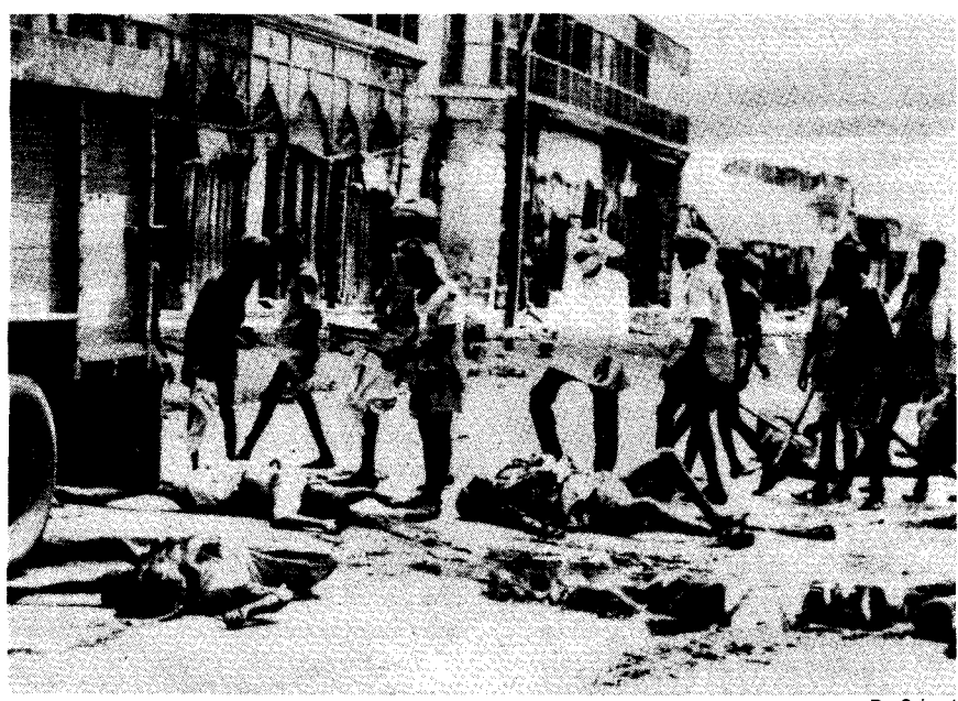
Legacy of brutal British colonial rule in the Indian subcontinent was communal slaughter during 1947 Partition.

At the end of World War II, West Europe was pregnant with social revolution. The Soviet Union had acquired enormous new prestige from the Red Army's victory over Hitler's Wehrmacht, while large sections of the European bourgeoisies were tainted by their collaboration with the Nazi occupation forces. Especially in Italy and France, the national Communist parties had also gained greatly increased authority in the working class.