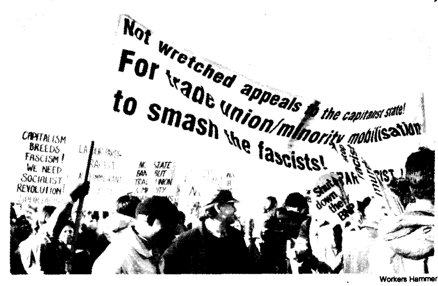
Spartacist League contingent at 16 October 1993 anti-fascist mobilisation. Trotskyists fight for a class-struggle strategy to smash fascist terorists.