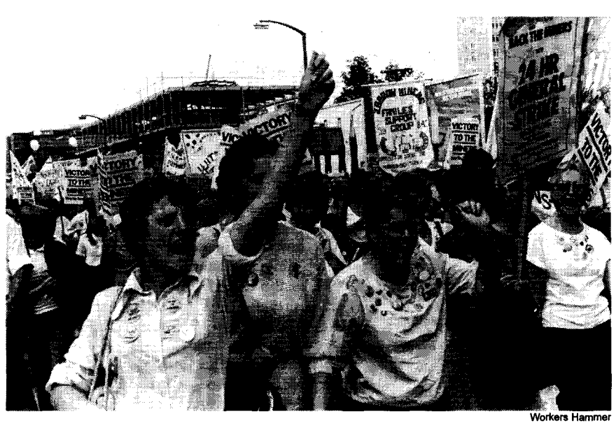
Courage and determination of women of the coalfields was key to maintaining backbone of strike.

We Marxists often say that women are doubly oppressed as workers and as women. The miners strike showed the capitalists' attempts to keep women confined to traditional roles in the home can