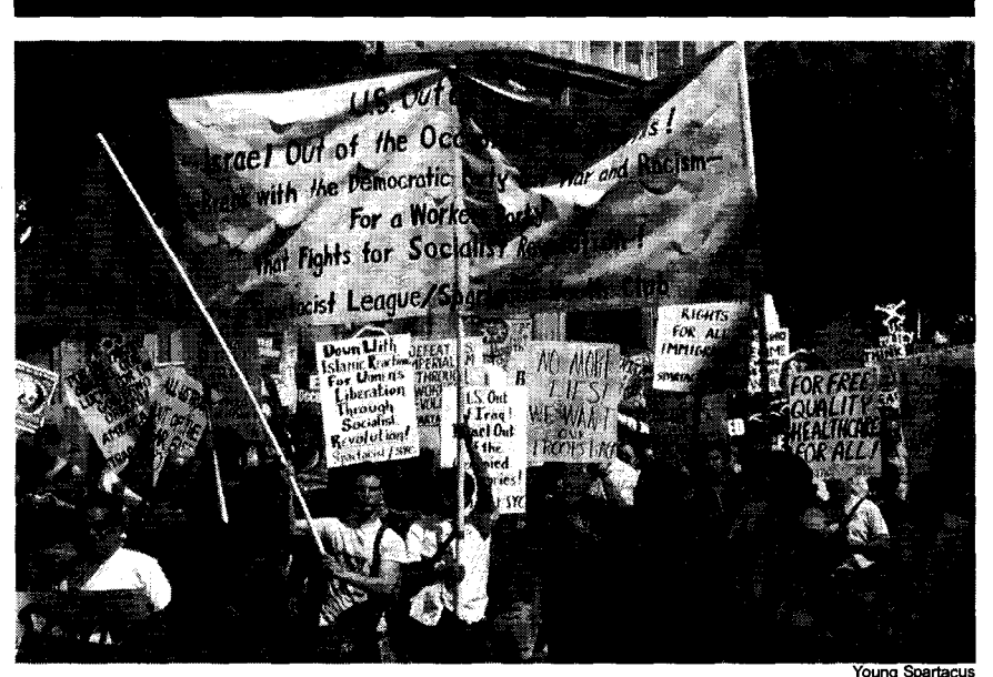
Spartacist contingent at 20 March protest in Los Angeles against US occupation of Irag.

What does Iraq look like since the ballyhooed handover of sovereignty?