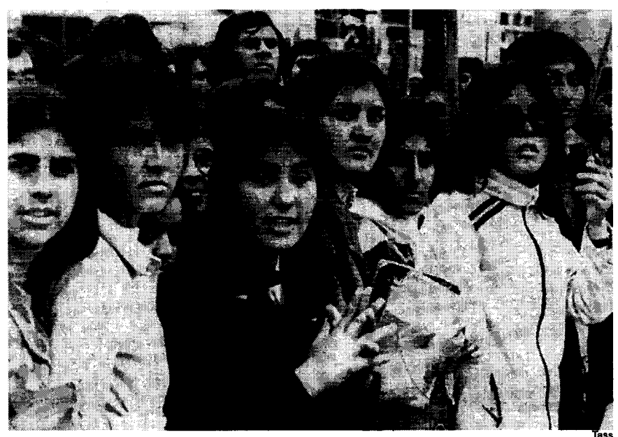
Above: Afghan women in western-style dress in 1980, as Soviet Red Army intervention opened prospect of social emancipation. Since its withdrawal, women have been forced back into the oppressive burka and are shown below begging in Kabul in 2000.

Though I had many strong beliefs, I never thought beyond the bounds of capitalism. I grew up in a rural, backward area and people did not talk about socialism. I was only eight when the Berlin Wall fell and East and West Germany were united under capitalism, and was ten during counterrevolution in the Soviet Union. I always thought that