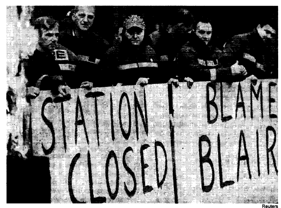
Autumn 2003 FBU strike posed potential for challenge to Labour government on eve of war.

first time that the state brutality they faced is the same treatment regularly dished out to British black and Asian minorities. We apply this lesson today when we say that the unions must oppose the so-called "war on terror"