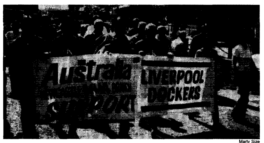
Liverpool, Mayday 1997. Australian maritime union supports dockers.

internationally, you have to look at the international picture and what's called the "post-war consensus".