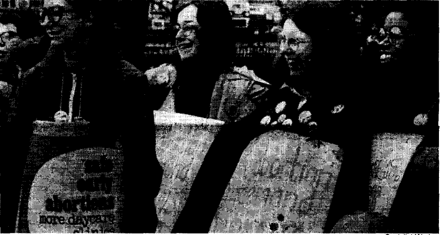
Women's rights are won through struggle. International Women's Day, London 1971, first women's liberation demonstration in Britain (top). London 1979, demonstrators campaign in defence of abortion rights.

religion reinforces authority and conservatism.