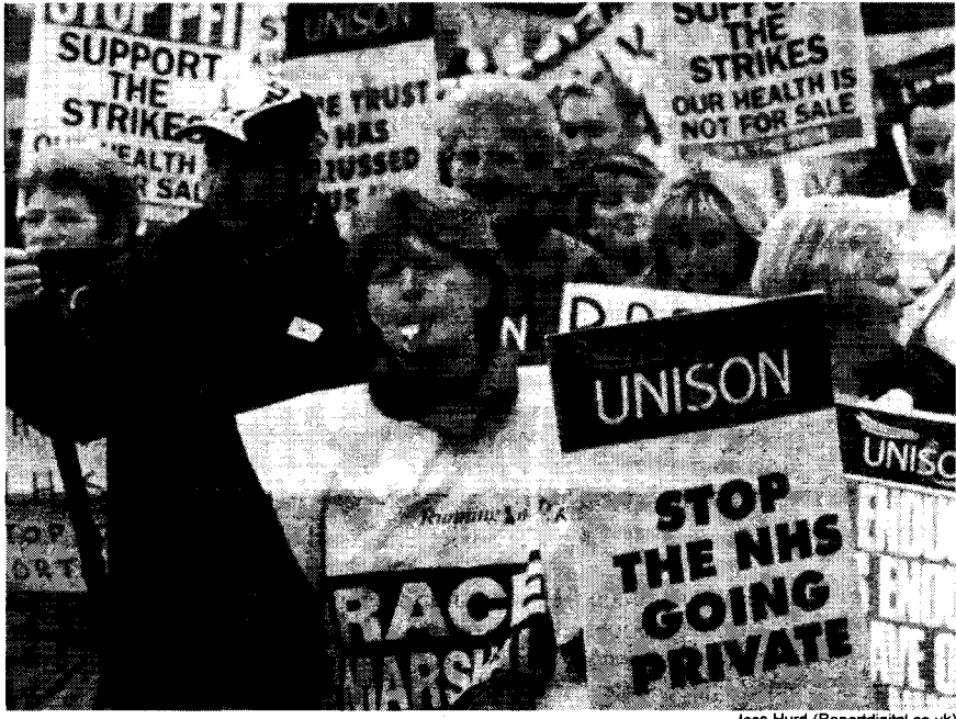
Unison protest by low-paid women health workers against Labour's partial privatisation of Dudley NHS hospital, West Midlands in 2000.

By the mid/late-1960s, there was growing disillusionment in the post-war promises of prosperity and increasing combativity among the working class in the face of attacks by Harold