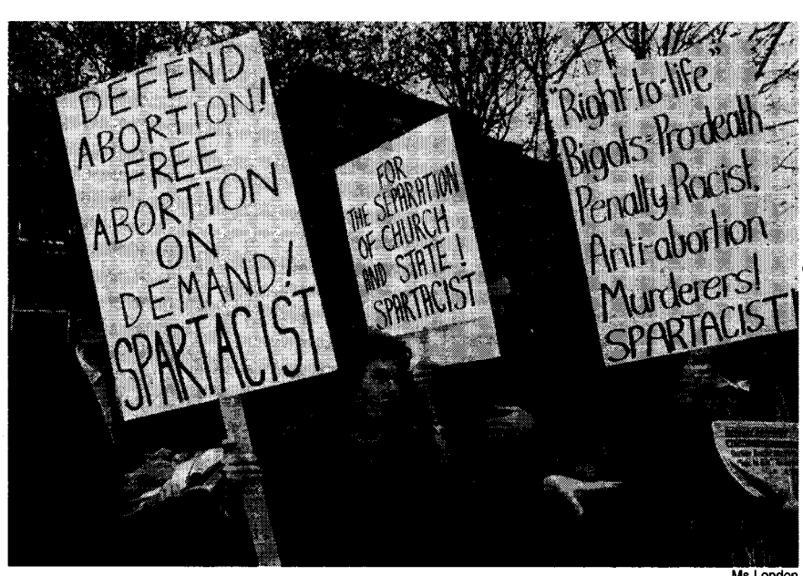
London 1993: Spartacist League placards at demonstration against reactionary anti-abortion forces.

Introduced as a means to buy "social peace" among a restive proletariat, the