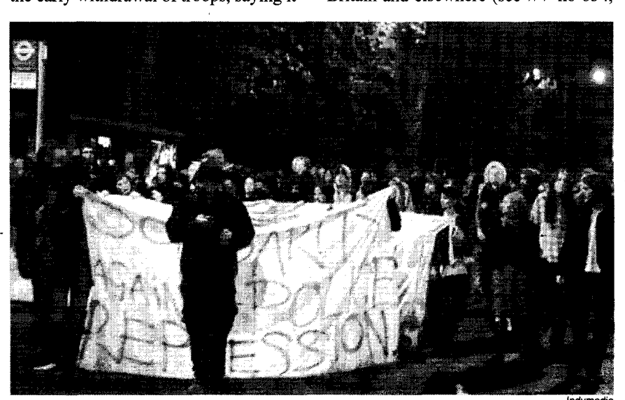
London, 16 October: Anarchists (above) leaving Alexandra Palace after staging gutsy protest at ESF meeting where Labour Mayor Livingstone was due to speak. Banners said "Ken's Party, War Party" and opposed police repression.

World Is for Sale". Various anarchist speakers addressed the assembled for about half an hour, protesting about harassment by Livingstone's cops and the FBI seizure of Indymedia servers in Britain and elsewhere (see WV no 834,