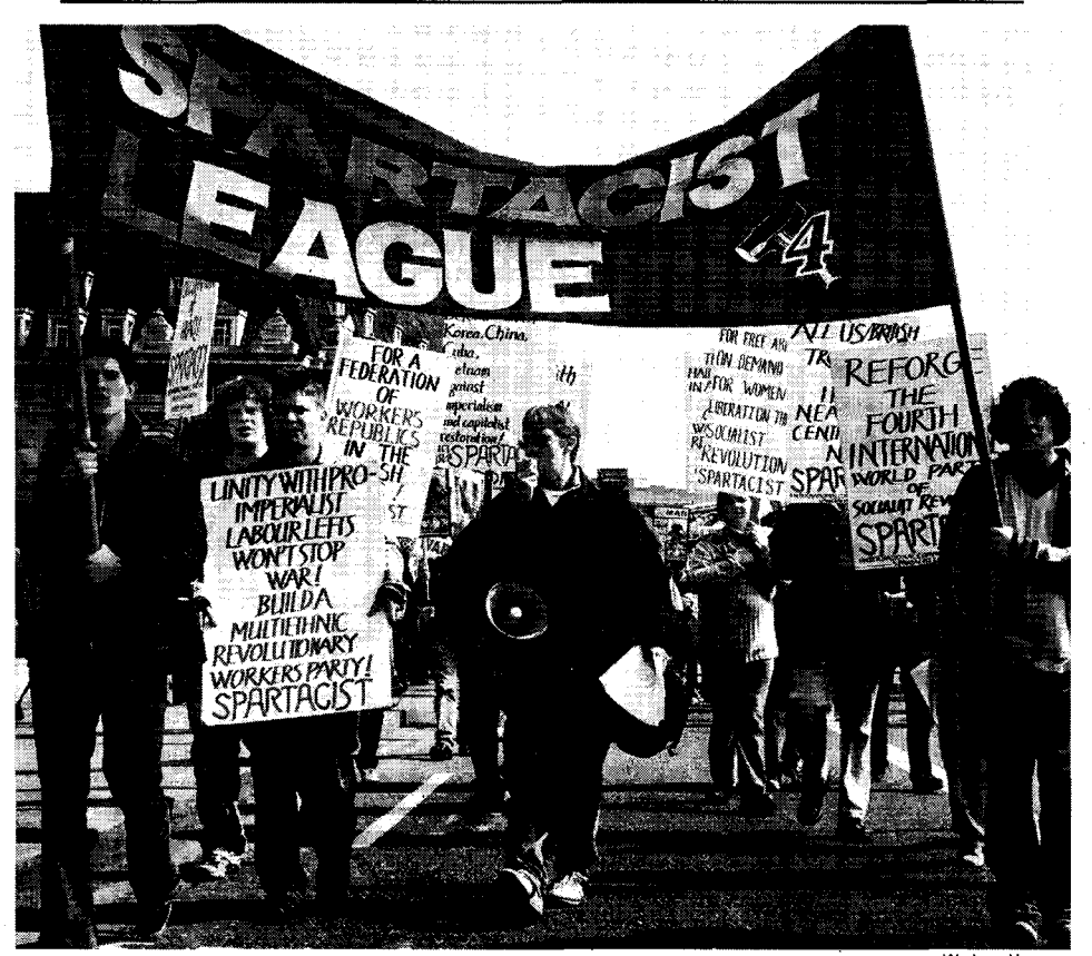
Spartacist League/Spartacus Youth Group contingent on 12 April 2003 London antiwar demonstration.

Union. At the same time we fought for proletarian political revolution to oust the Stalinist misleaders. The collectivised property forms that were the basis for these states, as opposed to the capitalist mode of production for profit, provided jobs, education, health care