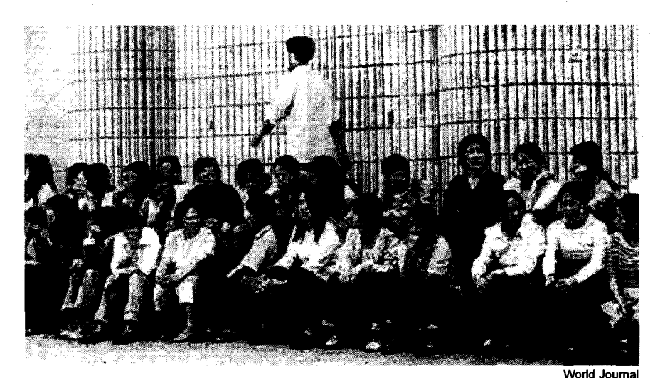
Workers employed by Computime, a Hong Kong-mainland joint-venture company, protest harsh working conditions and low pay outside factory in Shenzhen, October.

The lie of building "socialism with Chinese characteristics" has led to China losing 15 million manufacturing jobs in state-owned enterprises (SOEs) between 1995 and 2002. Prostitution is skyrocketing, and female infanticide is rampant in the countryside. There are over 100 million people living on less than $106 per year. The United States has about 40 per cent more acreage under cultivation than China, yet the Chinese agricultural labour force is 100 times larger than that of the US. And the