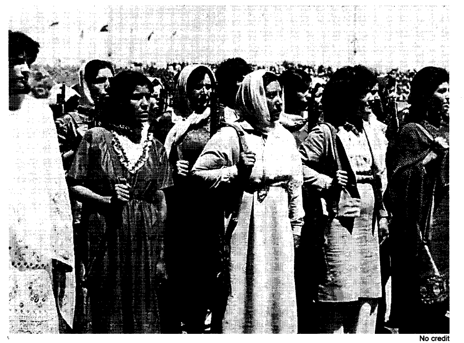
Afghanistan, July 1989: Soviet Army opened the possibility of liberating women from Islamic fundamentalists who were massively backed by CIA.

Today Washington is again taking advantage of longstanding ethnic and religious divisions in the country, from deploying Kurdish army forces in Falluja to dangling the carrot of serving as anointed satraps before the Shi'ite leaders. Many Iraqi Kurds (part of the Kurdish nation which also geographically spans parts of Iran, Turkey and Syria) wrongly look with hope to the