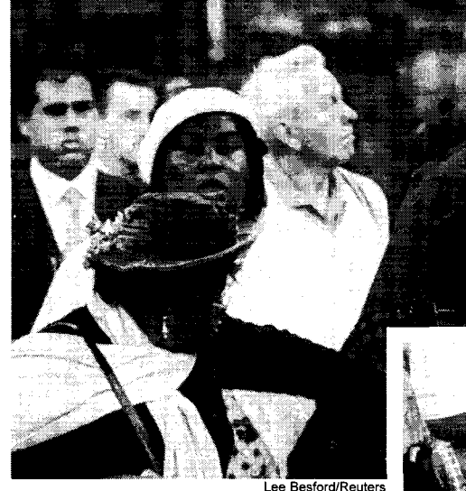
A group of islanders from Diego Garcia (above) arrive at the High Court in London. Families protest against British imperialism's racist expulsion of islanders (right).

eign Office documents, suffused with racist imperialist contempt for the people of the Chagos islands, demonstrating that the depopulation was calculated to suit the aims of British and US imperialism. One official wrote that the removal of the islanders "was made virtually a condition of the agreement when we negotiated it in 1965". In return, Britain would receive