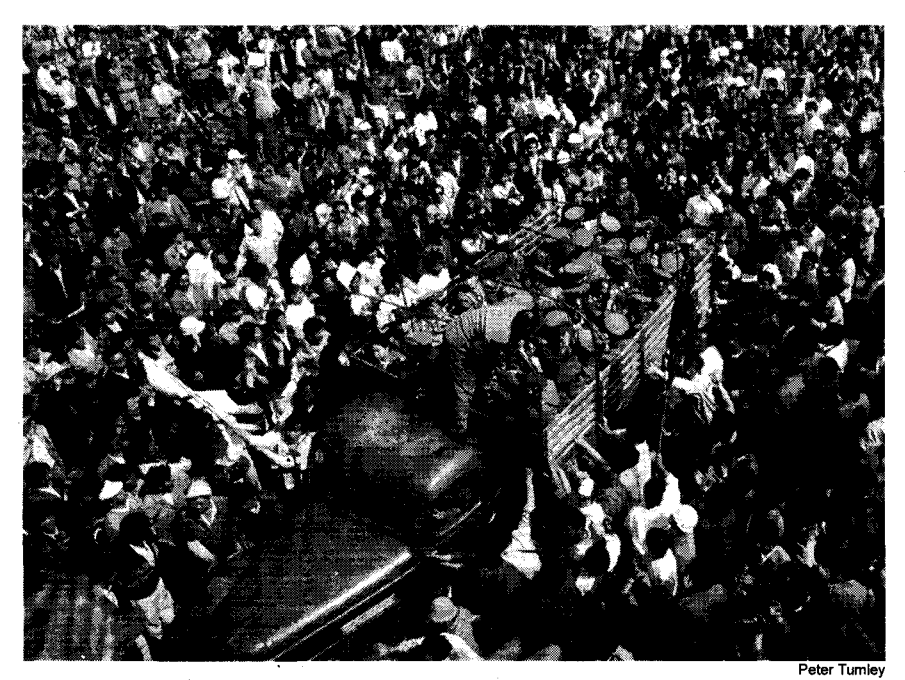
Beijing, May 1989: Workers and students fraternise with troops called in to suppress uprising which marked incipient political revoloution against Stalinist regime.

Lenin described soviets (workers councils) as "the direct organization of the working and exploited people themselves, which helps them to organize and administer their own state in every possible way". Migrant workers would be critical to help spread this type of organisation into rural communities. Coordinated nationally, these organisations could have been the basis for a revolutionary regime of workers democracy counterposed to the Stalin-