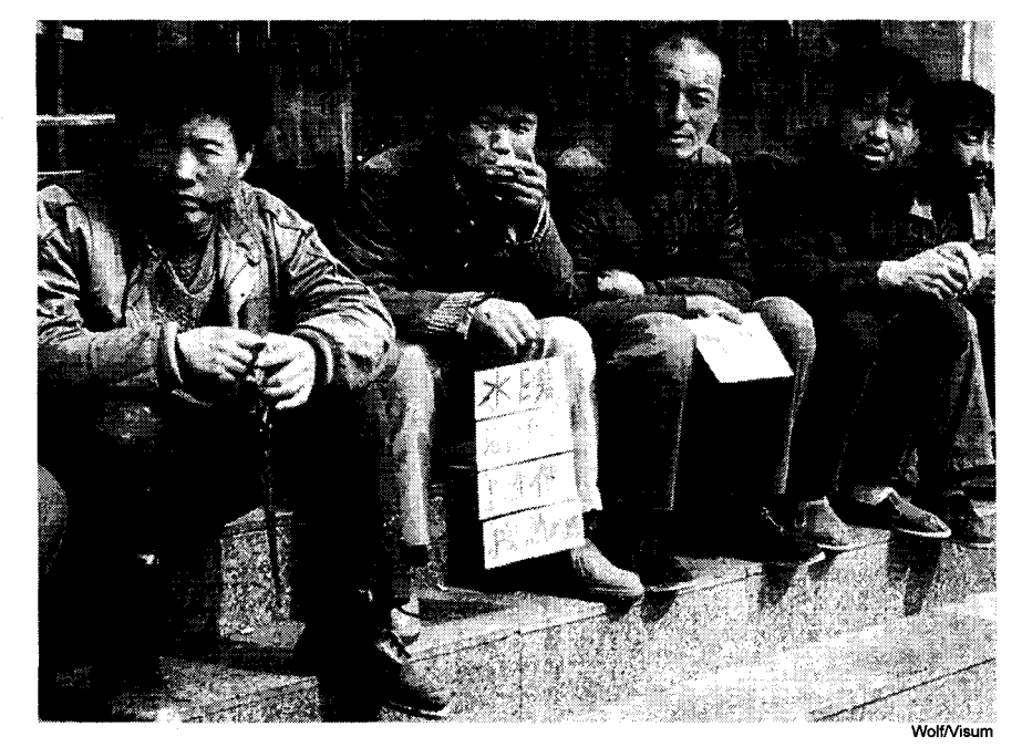
Unemployed workers in Shenyang, part of China's "rust belt".

Ultimately, the only way to resolve the shortage of arable land in China in the interests of workers and poor peasants is by extending the revolution to an industrially advanced capitalist state