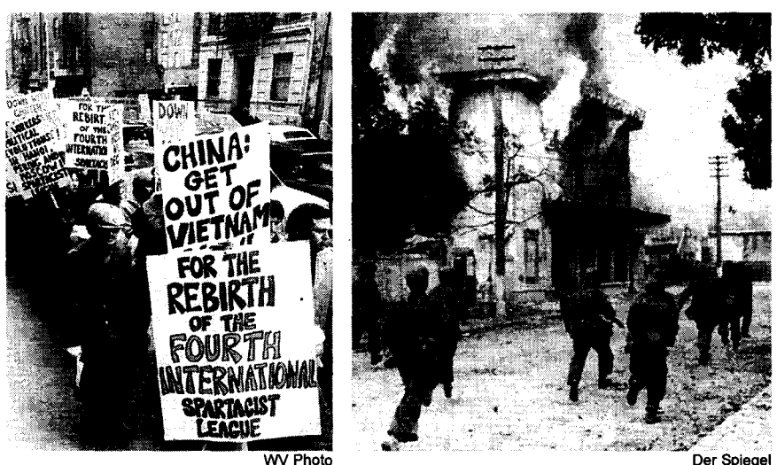
1979: Spartacists demonstrate at Chinese Mission in New York City against Chinese government's invasion of Vietnam which was a shameful illustration of US-China anti-Soviet axis.

racy", we ask: for what class? Many students and intellectuals had illusions in the bourgeois democracy of the US. This was conditioned by China's alliance with US imperialism.