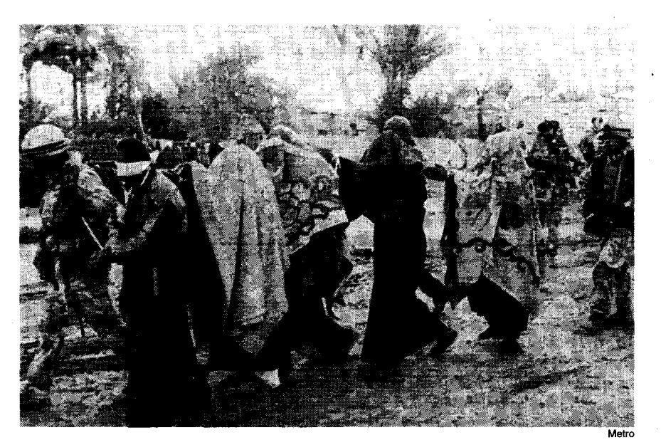
November 2004: In aftermath of assault on Falluja, British troops terrorise civilian population near Baghdad.

Seemingly trying to combine the most reactionary aspects of religious fundamentalism and Labourite chauvinism, the recent Respect conference decided to run candidates against Labour in a handful of seats in the general election, and to consider voting Labour elsewhere! Voting Labour would be nothing short of an endorsement of British imperialism's carnage in Iraq not to mention the racist "war on terror" at home! Respect is not even a working-class formation to which Marxists could consider giving critical support in elections. But even if it were, we wouldn't dream of giving electoral