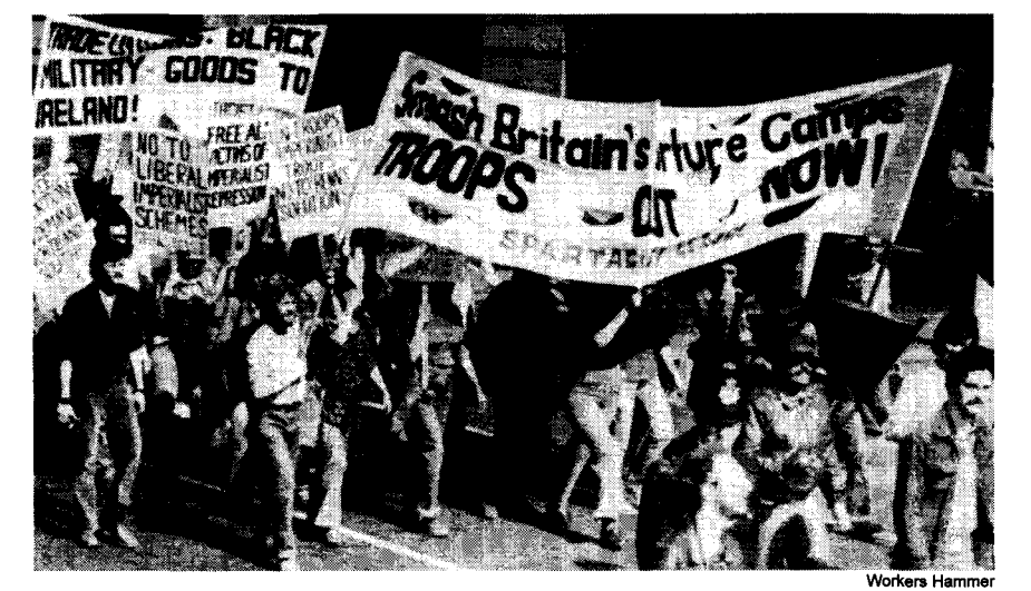
London, June 1981: Spartacist League contingent demands British troops out of Northern Ireland, protests Westminster butchers' H-Block murders. Muslims are now target of same repression visited upon Northern Ireland Catholics.

Within hours of the horrific London bombings that killed over 50 people and injured hundreds, Tony Blair seized on this atrocity as a pretext to escalate the "war on terror". Let's be clear: these bombings were a criminal act of indefensible terror. Like the attack on the World Trade Center and the bombing of commuter trains in Madrid last year, the perpetrators share the same mindset as the imperialist rulers, identifying the working class and the whole population with the policies of the capitalist exploiters and oppressors. The bombs were aimed not at Bush or Blair, who were in Scotland for the G8 summit. but at the multiethnic working people of London: areas such as Edgware Road, which is overwhelmingly Arab;