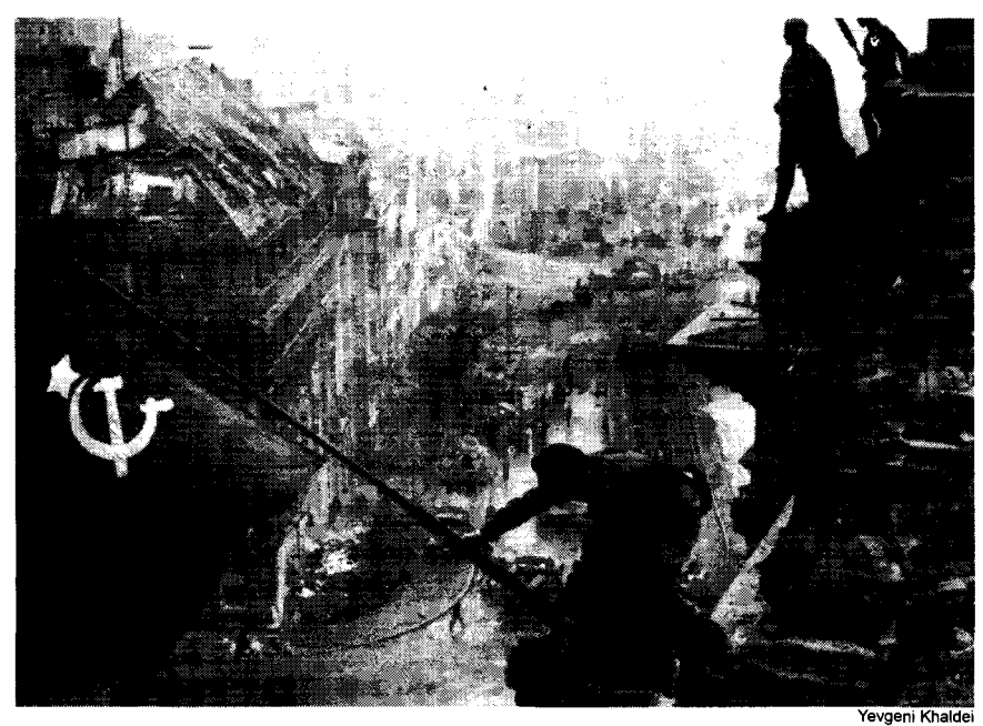
May 1945: Soldiers of the Red Army raise the red flag over the Reichstag of defeated Nazi Germany. Obscenely, this Soviet flag was claimed by Russia's capitalist rulers at this year's commemoration in Moscow.

chip made in the DDR. However, the product run on the assembly lines was always small and productivity was low. DDR scientists and engineers were forced to develop everything and produce every part for themselves—a "socialist economy in one country" that exhausted the resources. The political isolation of the DDR from the hi-tech