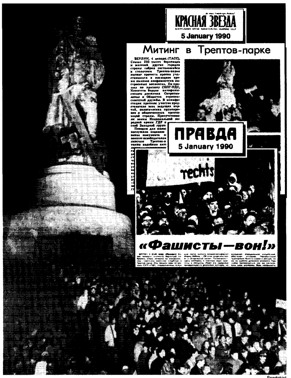
250,000-strong anti-fascist mass demonstration initiated by German Spartakists at East Berlin's Treptow Park in January 1990 was featured in Soviet Army newspaper Red Star , and Pravda .

I went to the USSR in the immediate aftermath of the August '91 coup/countercoup, which was a crucial point in the counterrevolution and overthrow of the remaining gains of the October Revolution. I also spent some time in the ICL's Polish section. I was at the Treptow Park demonstration and I was also involved in work towards the Soviet Army. There were 400,000 Soviet soldiers stationed in East Germany, and that was the de facto state power there. You could not have anything resembling a programme for political revolution in that country without confronting this basic question of the Soviet Army. In East Germany, it helped to have some appreciation of the fact that in Hungary in 1956 there was a political revolutionary uprising against the Stalinist bureaucracy. The Kremlin sent in the Warsaw Pact forces with the lying claim that they were going to put down a fascist uprising. The soldiers found nothing of the sort. Instead they found workers councils, and workers who were ready to die to defend collectivised property, but who were rebelling against the Stalinist bureaucracy. The fraternisation between the Hungarian soviets and the Soviet soldiers meant that the Kremlin was