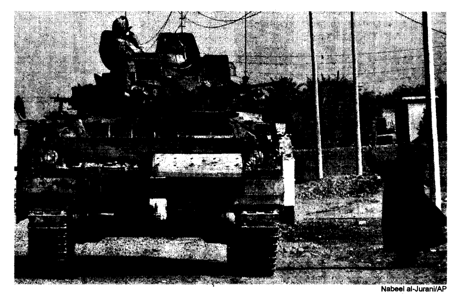
A British tank rolls through a village in Iraq. US/British occupation brings death and destruction to the Iraqi peoples.

The purpose of the "war on terror" is to stifle class struggle and to regiment the working masses through domestic repression, the better to free the hands of British imperialism for its bloody