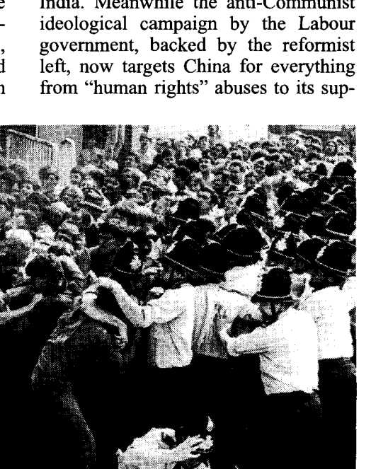
August 1984: Miners' pickets battle with scabs and cops in Yorkshire coalfield.

The Conference Document noted that the imperialist powers have been steadily ratcheting up the military pressures on China—from US-Japanese military co-operation over Taiwan to the construction of a ring of US bases in Central Asia to the building up of the US base at Guam in the Pacific to American assistance to nuclear-armed India. Meanwhile the anti-Communist ideological campaign by the Labour government, backed by the reformist left, now targets China for everything from "human rights" abuses to its sup-