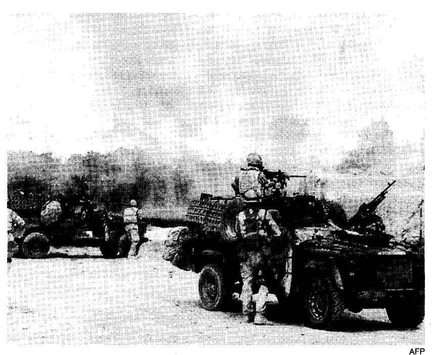
Spartacist League contingent at September 2002 protest against US/British imperialism's war moves against Iraq. British troops (right) in Southern Afghanistan killed 21 people in June 2006.

defence of the Chinese, North Korean, Vietnamese and Cuban workers states against imperialism and domestic counterrevolution" and our call for proletarian political revolution to oust the Stalinist bureaucracies.