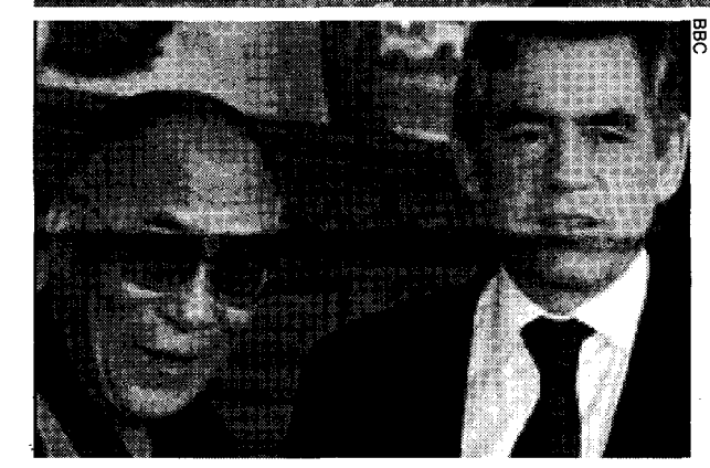
Above: People's Liberation Army troops rescue survivors of earthquake in devastated city of Beichuan, China. Left: Brown meets Dalai Lama, May 2008.

deal for Northern Ireland, the Conference Document stated: "The very idea that the blood-soaked British imperialists were bringing 'peace' to the 'warring tribes' is the vilest hypocrisy." The Catholic minority remains oppressed and the society today is more segregated along communal lines than it was when the troops were sent there in 1969. Northern Ireland has historically been used as a testing ground for state repression in Britain—the vilification of Muslims in Britain today echoes the treatment of Irish people in the 1970s and '80s.