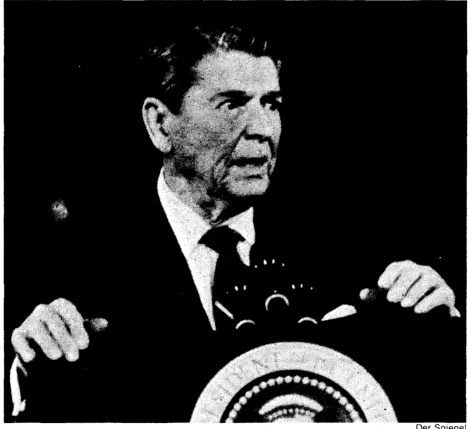
Imperial president: cornered and crazed. KO Reagan and the Democrats with hard class struggle!

"The trouble is that perhaps we could have afforded to be governed by a goodnatured, doddering old gaffer when times were good. But now the stakes are simply too high and the issues too complex.... Maybe the only thing we have