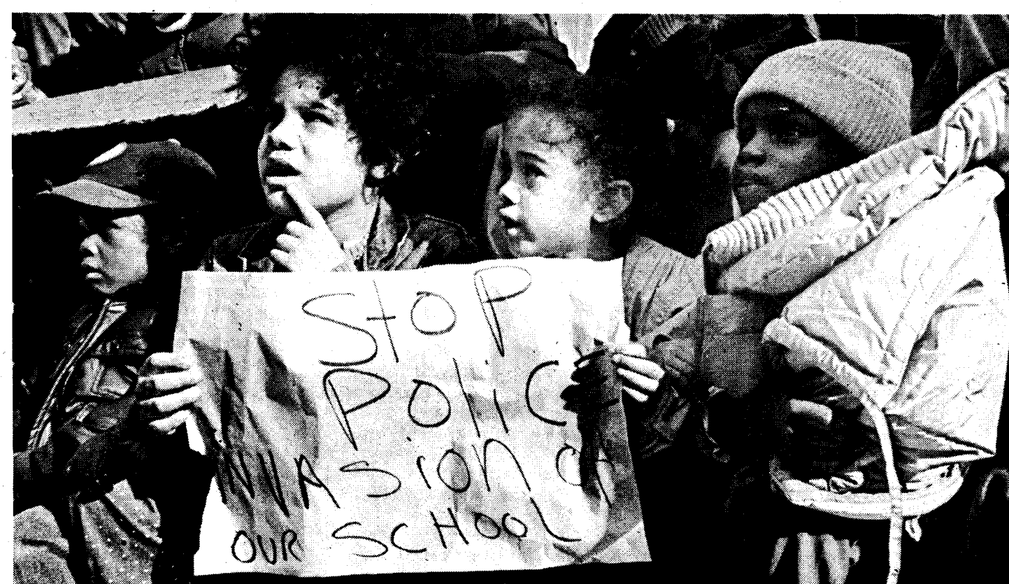
The latest victims of NYC cop terror—defenseless minority schoolchildren terrorized in their classrooms.

On the morning of Friday, November 6, some 30 cops rampaged through the small private school, whose predominantly working-class student population of pre-kindergarteners to eighth-graders is 90 percent black. Students were chased and pulled out of classrooms without explanation; one student was slammed against a wall. When principal Simpson attempted to consult the school's attorney before admitting a continued on page 11