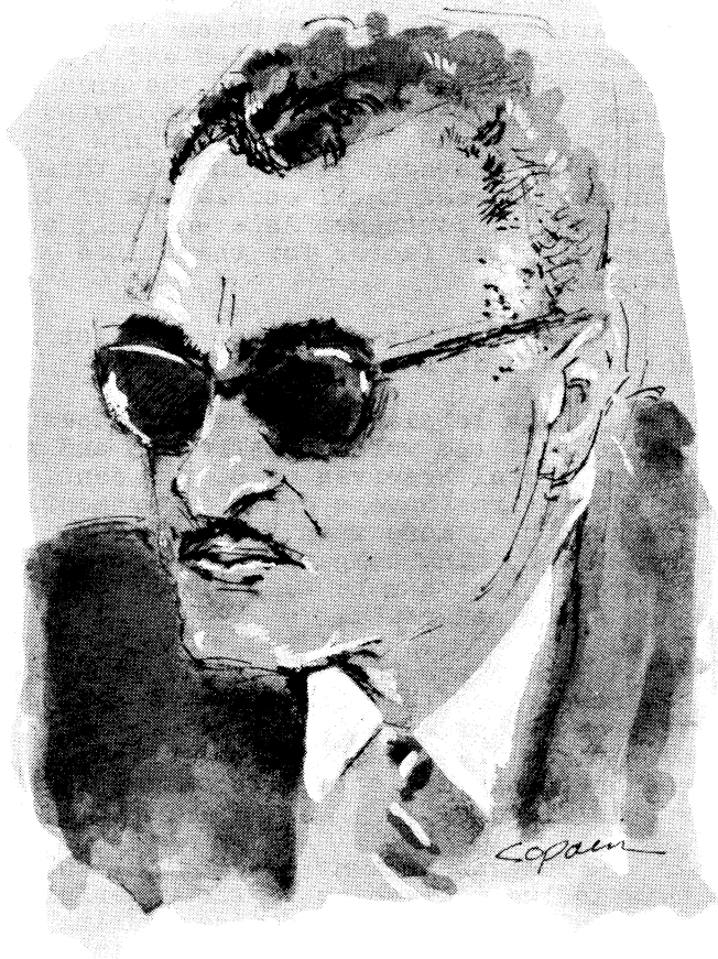
GAMAL ABDEL NASSER