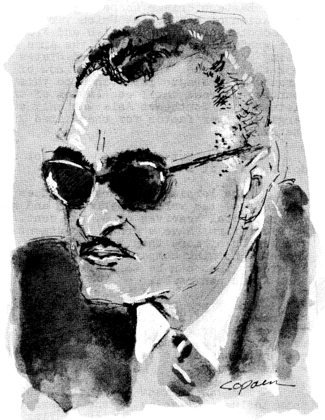
GAMAL ABDEL NASSER

The New York Times is keenly aware of this and has been drawing some lessons about it for the edification of those entrusted with the destiny of U.S. imperialism. These make very interesting reading.