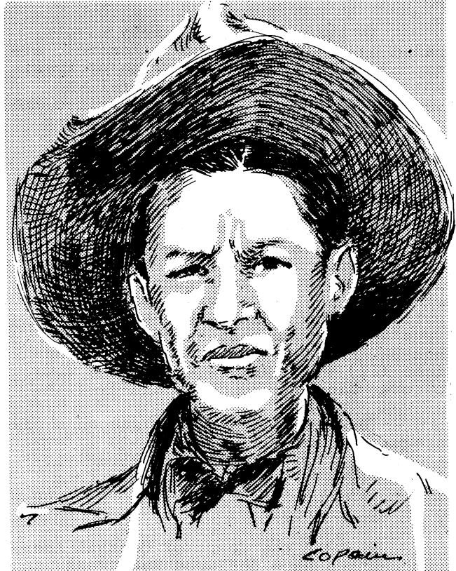
AUGUSTO CESAR SANDINO

"Wherever death may surprise us, let it be welcome if our battle cry has reached even one receptive ear and another hand reaches out to take up our