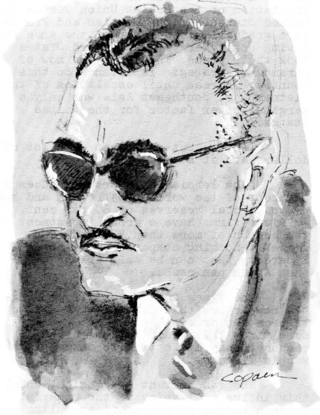
GAMAL ABDEL NASSER