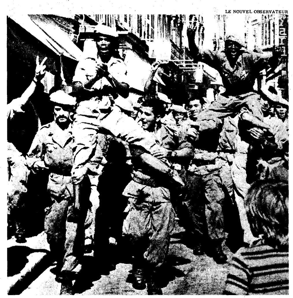
French soldiers rampaging through Draguignon demanding civil liberties.

The implicit support for the bourgeoisie's "national defense" flows quite consistently from the fact that the "Call of the 100" accepts the existence of the bourgeois army itself. Most of the soldiers do not in fact regard the campaign built around the "Call of the 100" to be "anti-militarist," much less "revolutionary." As one soldier char-