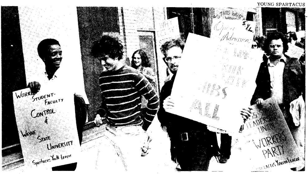
Economic crisis has sparked campus worker, anti-budget cut struggles. SYL marching in demonstration at Wayne State University, Detroit.