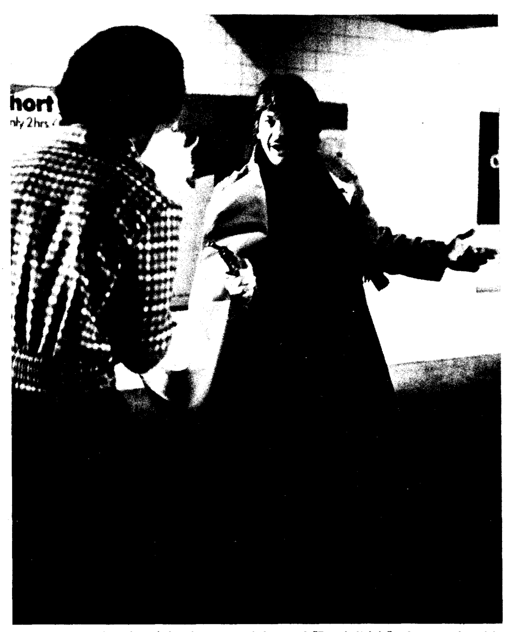
His wife murdered and daughter raped, hero of "Death Wish" takes law into his own hands as a vigilante exterminating muggers and rapists.

The first two requirements have now been dropped, and there is continued pressure for eliminating the remaining corroboration requirement—proof of forcible compulsion and the attempt to commit the rape (e.g., semen on the clothes of the victim). These corroboration requirements have in the past been the primary obstacle to more frequent convictions of accused rapists, since in many cases it is virtually impossible to meet the requirements. Thus, reform of the rape laws by elimination of these corroboration requirements would