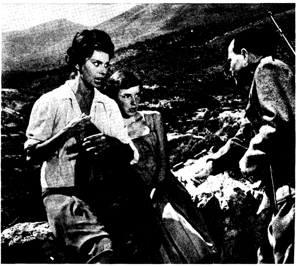
Film "Two Women" portrays psychological impact of a wartime gang rape on a mother and daughter.

The Vittorio de Sica film Two Women is a masterful portrayal of the brutality and dispensation of such wartime rape. In the film an Italian mother (Sophia Loren) and her virginal daughter, fleeing the advancing battle front of World War II Italy, take refuge in a deserted church. They are discovered by a group of soldiers who quickly surround them, separate them from each other, brutally rape them and then leave them lying unconscious