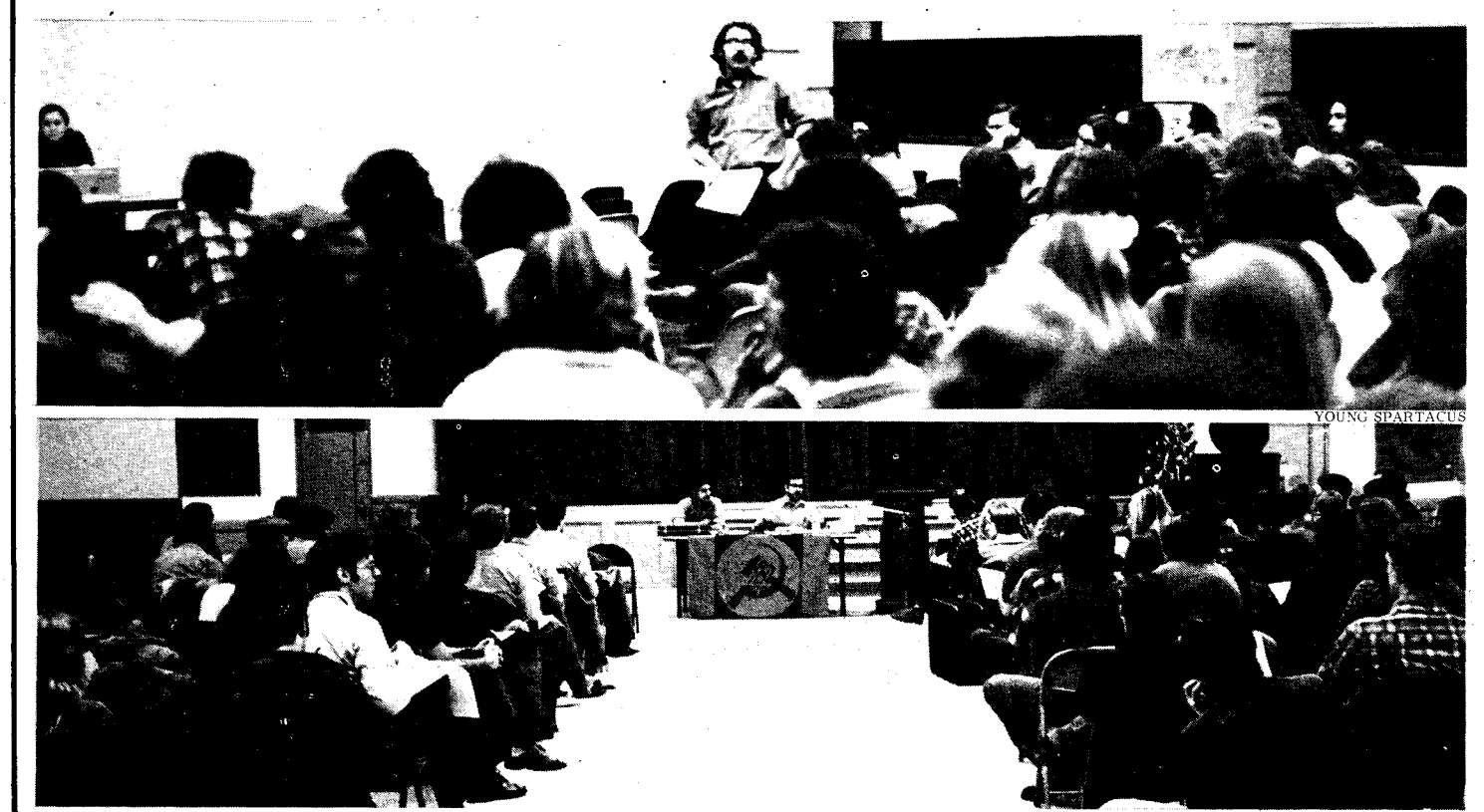
Sessions of SYL Educational Conferences: December 20–21 East Coast Regional (bottom), January 24–25 Midwest Regional (top).