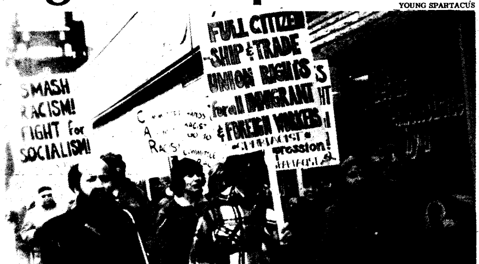
December 21 demonstration in Toronto sponsored by the Canadian Party of Labor, Canadian affiliate of the U.S. Progressive Labor Party.