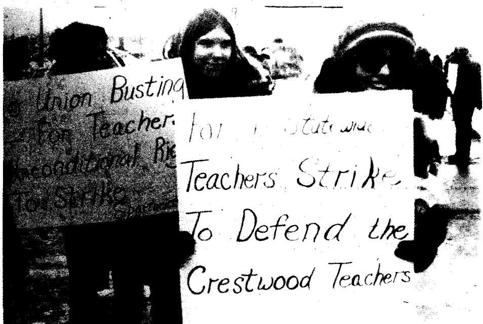
Picket line supporting Crestwood teachers.

The Michigan State Court of Appeals finally ruled yesterday that the Crestwood teachers must be rehired. While the union bureaucracy bubbled with "gratification" over the ruling, teachers must realize that they have little to celebrate in a decision that orders the disputed contract issues to be subjected immediately to compulsory arbitration, which can only mean in inadequate settlement for the teachers. Furthermore, the court ruled that the teachers were also at