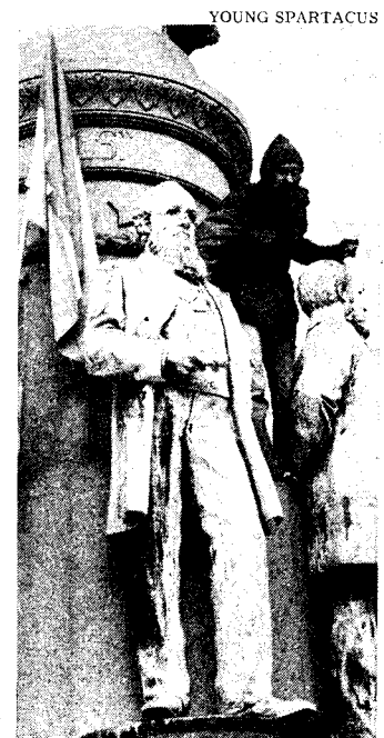
NEW LEFT NOSTALGIA: Effigy being toted to anti-Rhodes demonstration (left), NLF flag raised on public monument for rally (right).