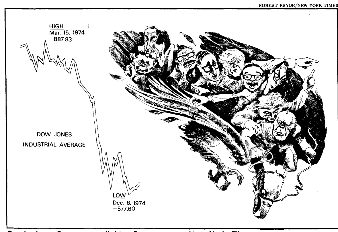
Graph from Dow Jones (left); Cartoon from New York Times (right).

The U.S. economy is now in the 16th month of what may be the worst slump since the Great Depression of the 1930's. A statistical indication of the acute crisis is the 2.2 percent decline in the Gross National Product from 1973 to 1974, which stands as the largest yearly drop since 1946.