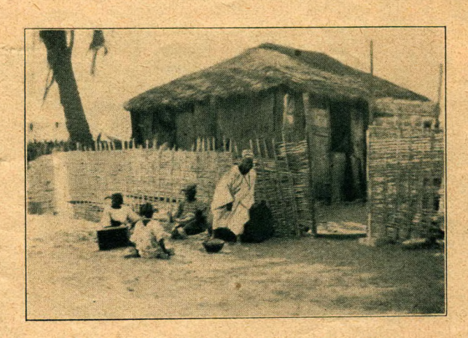
The home of a native worker in West Africa.

In the struggle against unemployment in the United States the Negro workers have played a particularly important part and especially in Chicago and