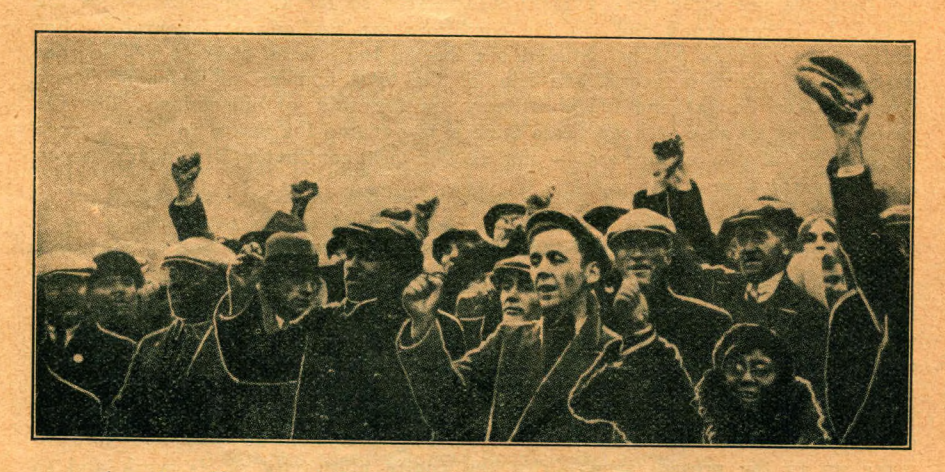
American Negro and White Workers delegation in the Soviet Union.

Not only unemployment but direct wage cuts are affecting every single industry in South Africa today. Particularly in the offensive starting in