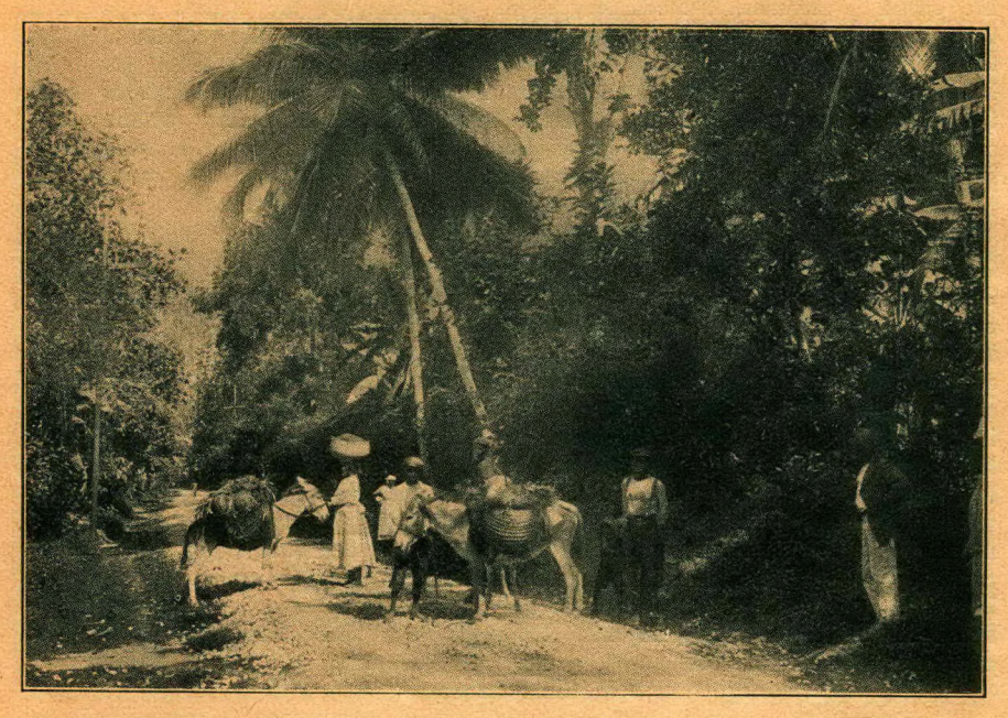
West-Indian peasants on their way to market; heavily taxed to maintain their British rulers they are forced to go as bare footed as their animals.

The conditions prevalent in these islands present a very important problem. Just as in India, the caste system is fully established. Under this vicious system of imperialist oppression the population of the islands is divided into categories. The lowest of these which comprise the road workers and the plantation and estate toilers are treated by the British overlords and their Negro bourgeois agents as "untouchables", and are always exposed to the most brutal exploitation and oppression. Imperialism considers them as the under-dogs, and this opinion