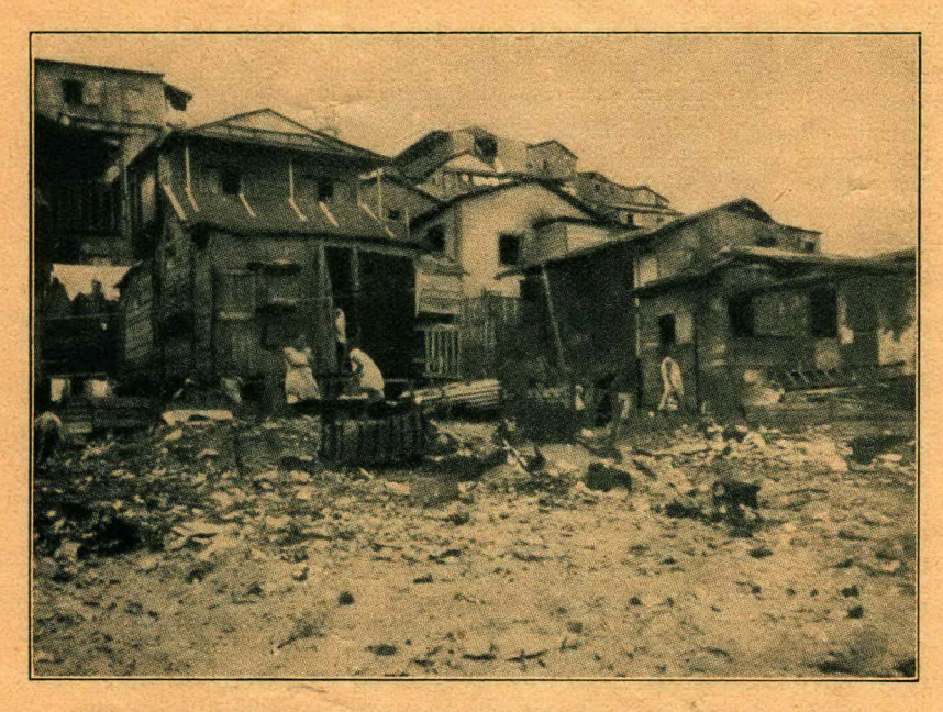
Disease infested homes of Negro workers in America for which they pay high rents to black landlords.