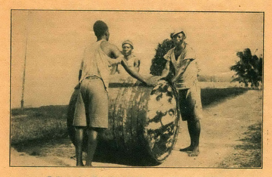
Rolling palm oil in Sierra Leone — at 9 pence per day.

a town more than 6 days if he is unemployed. With the result that the natives keep moving from town to town. This of course makes work difficulty, but on the other hand there are tens of thousands of natives who violate the bourgeois laws and still remain in Johannesburg and other cities. These unemployed natives could form the basis of a strong movement among the unemployed. Secondly, the question of struggle for relief in South Africa. Due to demonstrations and a number of struggles the poor white farmers and white workers were able to get relief from the government in Johannesburg and Cape Town. This relief was extended only to the whites and to the colored in Cape Town, but not to the natives. Since in South Africa the natives are considered as