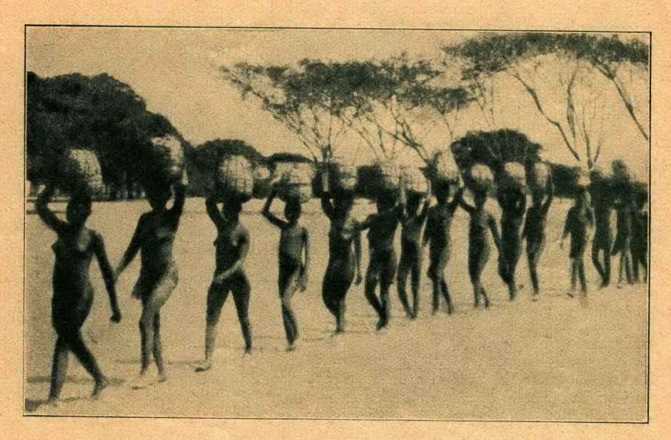
Women porters in the Congo.

This has the most disintegrating influence on tribal life, as the men are taken hundreds of miles away from home for months at a time. They are only released when their health is so broken that they are unable to work any longer. Between the year 1921 and 1925, the territory of the Upper Volta alone supplied 49,000 labourers for railway work, and 312,814 for the plantations, mines and factories.