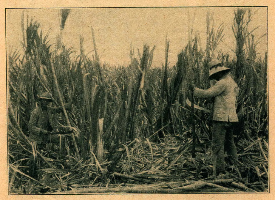
Cutting canes on American Plantation in Cuba at 30 cents per day.

In the West Indies and in Cuba where the colonies which are what one may call one-crop-countries, depending in the main on the production of sugar, the crisis has been particularly severe and has affected large masses of Negro workers. The policy of the colonial government in the West Indies is a policy of liquidation of the peasantry and the creating of a huge army of agricultural workers who are compelled to work on the plantations owned by the absentee landlords and foreign Corporations. There are certain sections in the West Indies where one can go throughout the countryside and find tens of thousands of natives living in actual starvation. They are compelled to live in company huts and those who happen to be working are getting a miserable pittance. The sugar crisis has paralyzed the entire sugar industry in the West Indies, throwing thousands out of work in Cuba. On the Cuban sugar plantations where large number of West Indians slaved there are about 80,000 Jamaicans, and about 30,000 Haitians who are today being returned to their respective islands to starve. In order to stern the tide of the growing revolts of the masses the British "Labour" Government was forced to contribute something from the treasury to ease the conditions of the starving population.