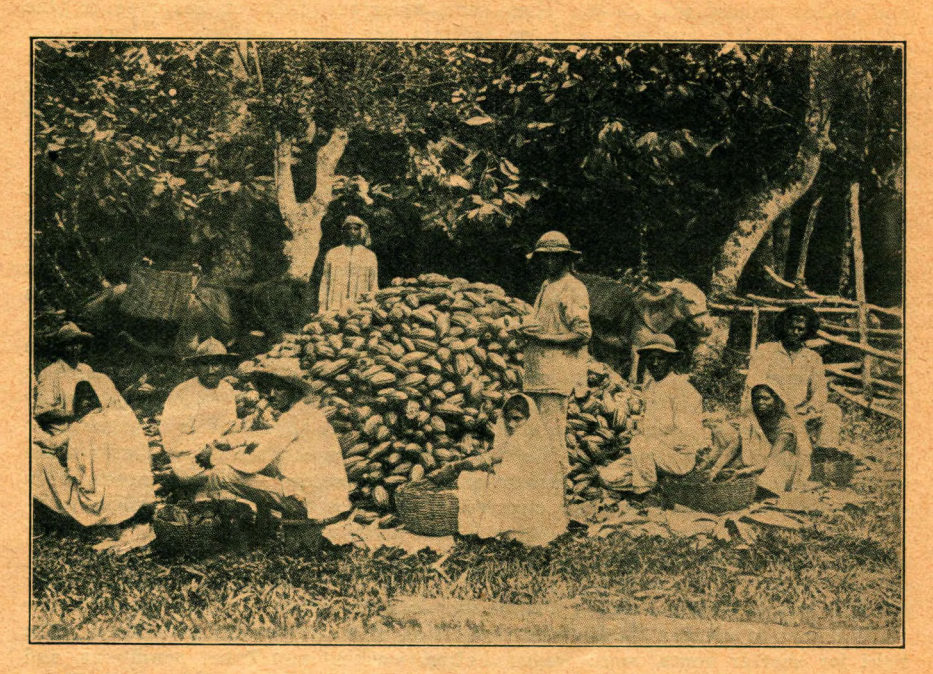
Coolie labourers on a cocoa plantation in Trinidad. These Indian workers are imported into the West Indies as indentured slaves to work for British and native capitalists. They get about 5 cents per day for 16 and 18 hours work.

Simultaneously with the development of the trade union movement, the workers and peasants have been carrying on agitation for a representative form of government, as well as struggles for reduction of the excessive high taxes. The imperialists fearing a popular uprising in those islands where the masses are most developed have acceeded to their demands. Jamaica, Trinidad, Barbadoes and Grenada have been granted limited representation on the Legislative Councils, in the others however, the Crown Colony system in the vilest form still prevails.