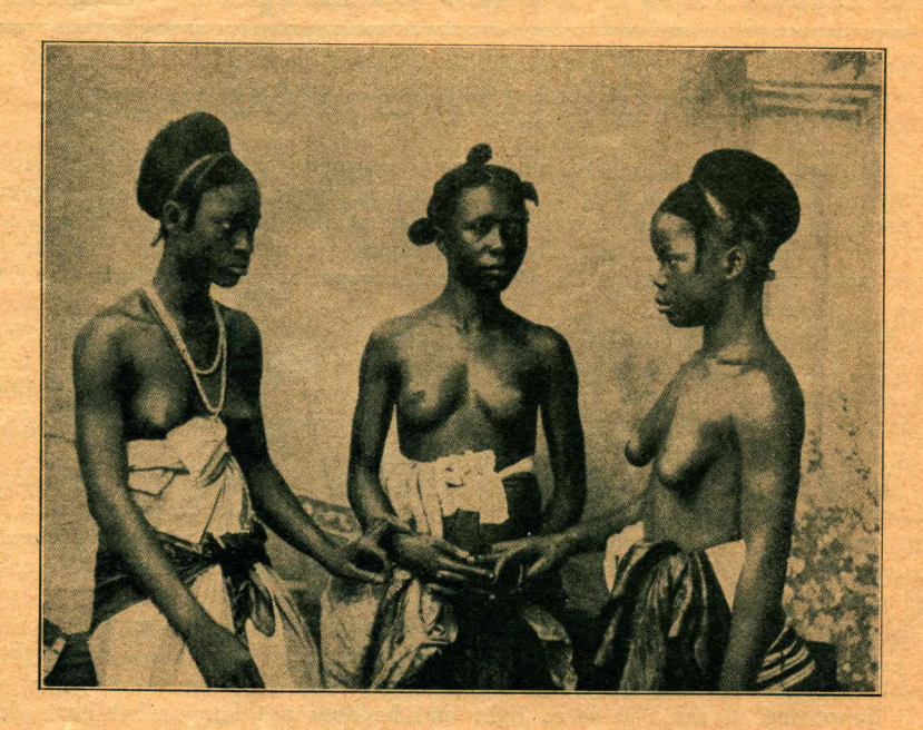
Types of African Girls raped by officials.

General Crozier gives his readers a very interesting inside of the way in which European officials, including a colonial governor carried on with another brother-officer's wife on one of Elder Dempster's boats. Although the passages of these officials and their families are paid out of the public revenue extorted out of the blood and sweat of the African masses, the author pays no attention to this point but proceeds to tickle his reader's pallet with the story of how this lady "with a heart susceptible to environement and shock" became the collective property of half a dozen officers, while the old governor tried his best to use his official position to keep the young bloods off.