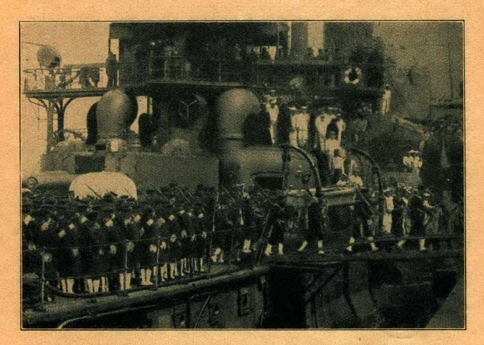
Sending workers to death, - Japanese marines landing in Shanghai.

the unemployed problem, by mobilizing the majority of the jobless and sending them to the front as cannon-fodder, while a few will be given jobs in manufacturing ammunition with which the workers in the various imperialist armies will be killing each other off. Furthermore, this will also enable the capitalists to increase their profits which the crisis has partly affected. Already these human vampires who gamble upon the wholesale murder of workers and their families are beginning to reap a rich harvest. Raw materials, such as wheat, cotton, sugar, hides, chemicals and all kind of metal for warfare which were on the decline up to a few months ago have suddenly gone up on the stock exchanges, while the manufacturers of ammunition in America, France, England, Germany, Chechoslovakia etc., are busy working night and day, preparing the deadliest