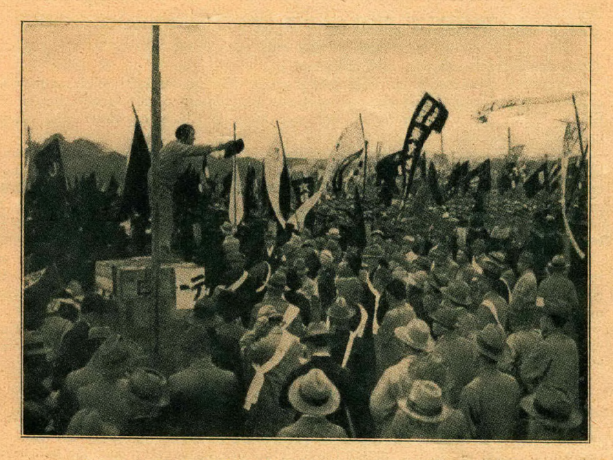
Japanese revolutionist addressing anti-war meeting in Tokio.

The United States is, however driving ahead for the mastery of China. It is striving to unite China, or a considerable part of it, under the bourgeois Nanking Government of China, in order, through that Government, to convert the whole of China into its colony.