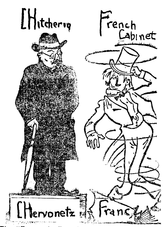
The "Economic Foundations." Two Ch's That Are Stable! Two F's That Are Toppling!

press was fond of making the joke that the little Bol-