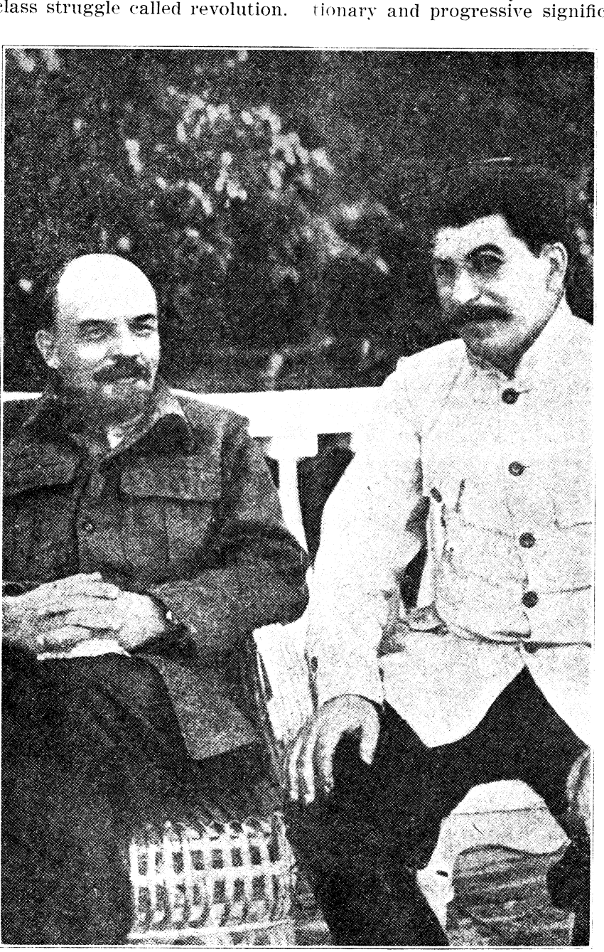
LENIN AND STALIN.

The American working - class will not follow the lead of its bourgeoisie. It will go with us against the bourgeoisie. The whole history of