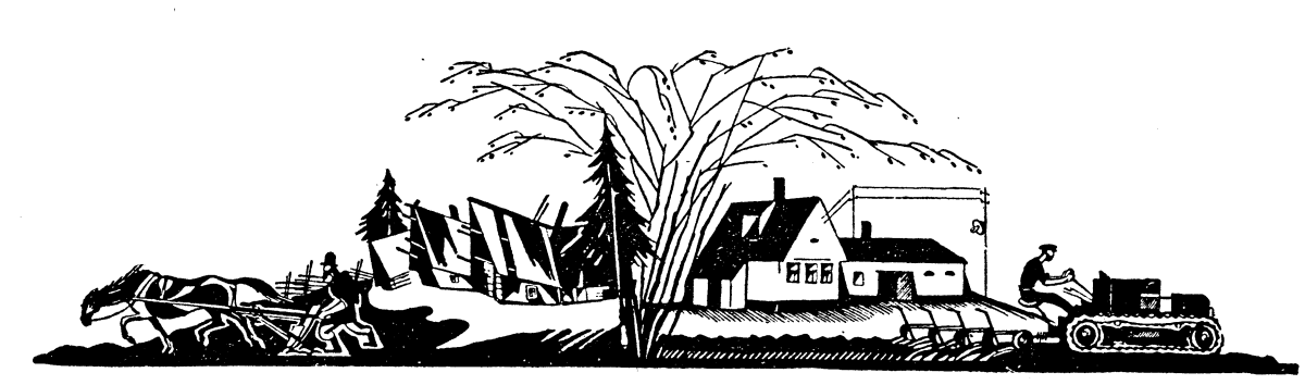
THE RUSSIAN PEASANT—The Past and the Future