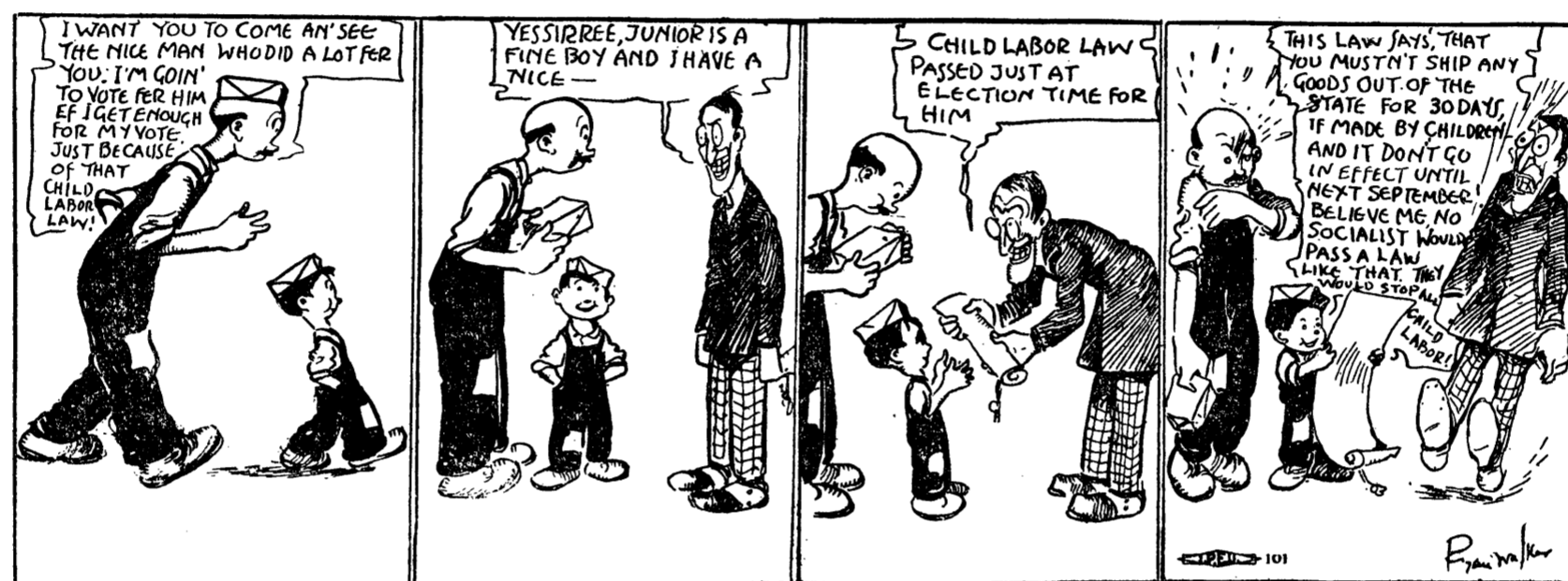
Henry Dubb takes Junior to see his friend, the President.