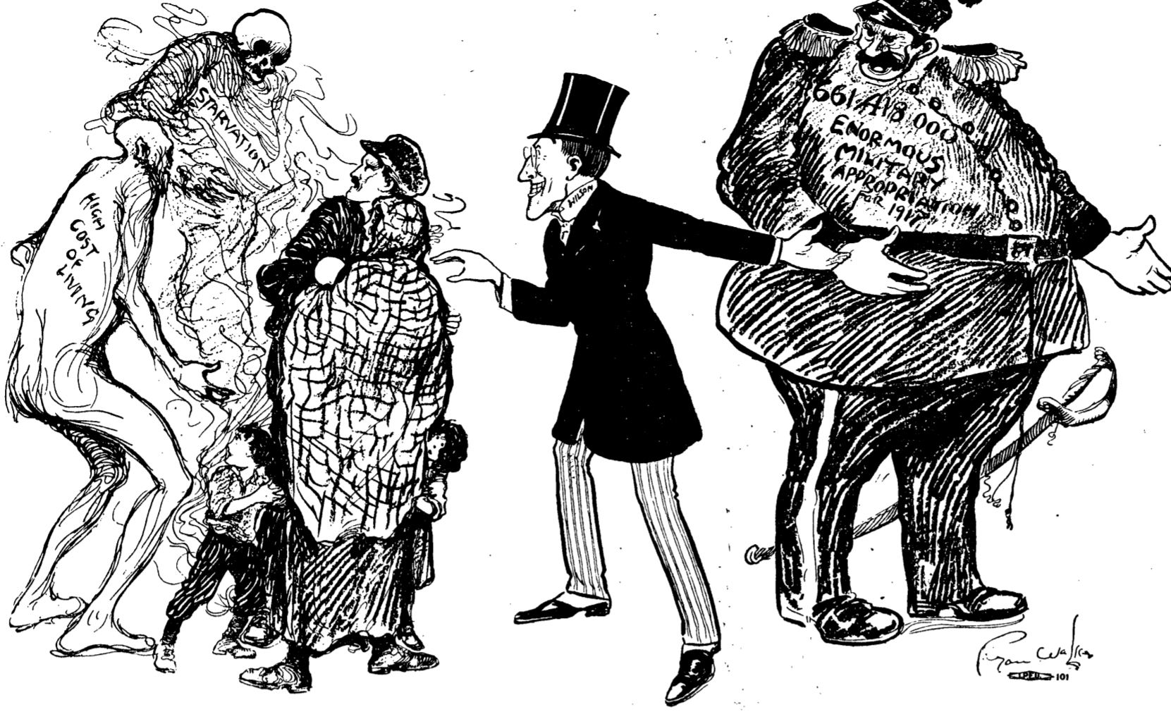
PRESIDENT WILSON: Don't notice those monsters of my administration, but look at this wonderful Military Appropriation I have given you!