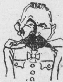
The White Guard General Miller

The fact that no attempt is being made to punish them shows clearly who is behind the white guards, and who is holding the bomb which is to explode and plunge humanity into a historical catastrophe. No other conclusion is possible. World public opinion must be perfectly clear on this point.