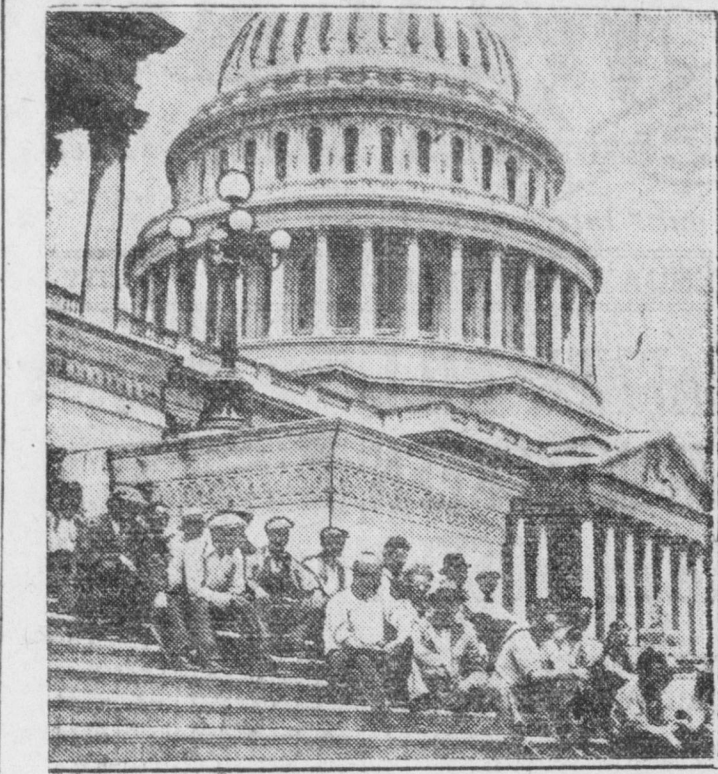
A group of bonus marchers on the Capitol steps. They carried slogans in the bonus parade Wednesday against hunger and war.