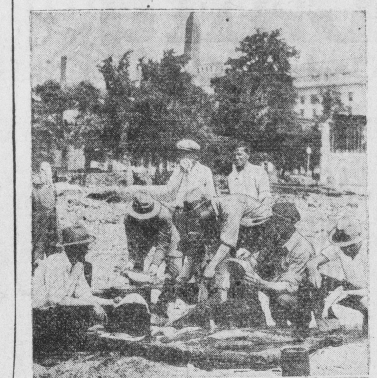
Eight thousand bonus marchers demanded that the city of Washington give them food. A group of vets are shown here cooking fish that they forced the local merchants to supply.