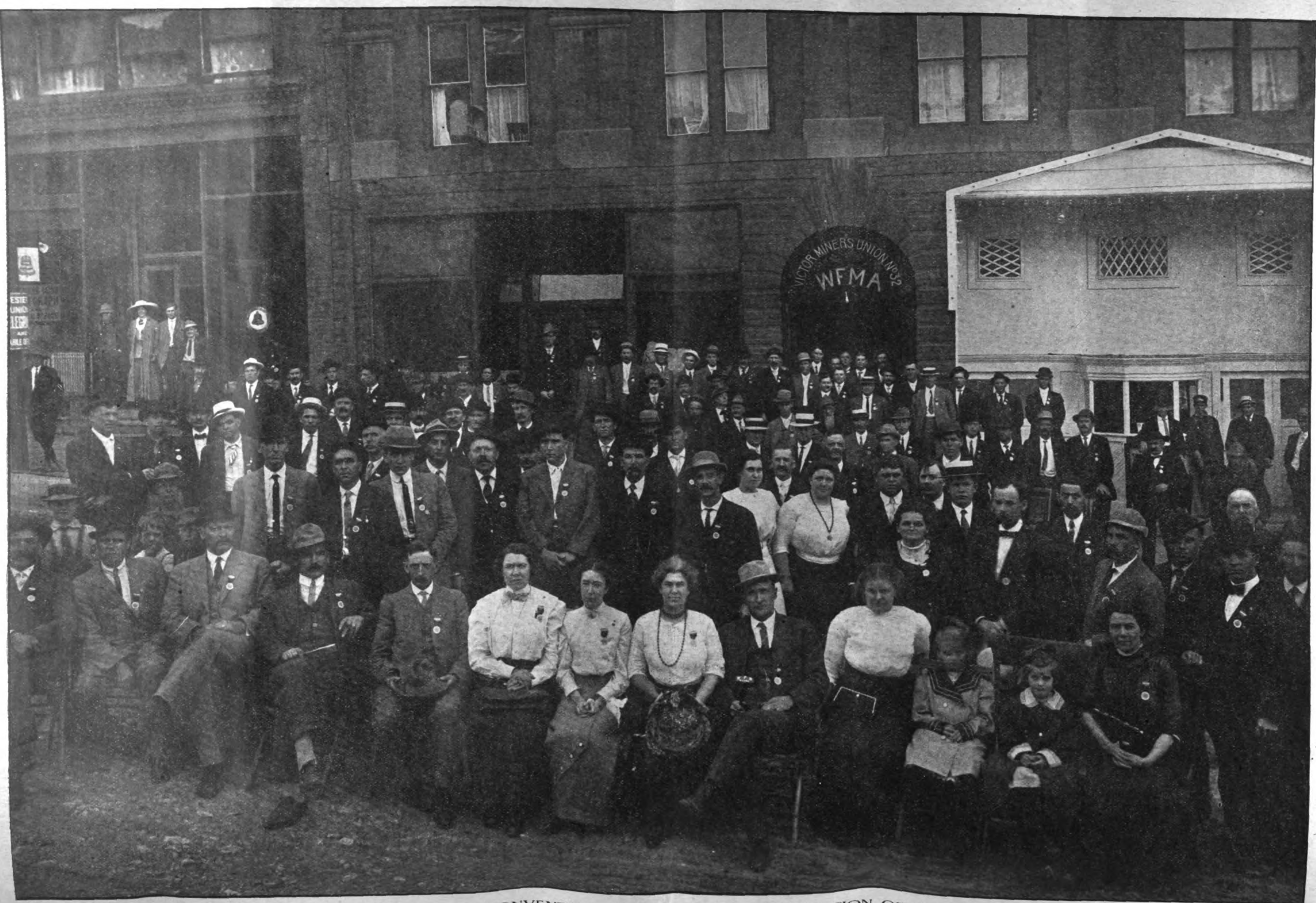
DELEGATES TO THE TWENTIETH ANNUAL CONVENTION OF THE WESTERN FEDERATION OF MINERS AT VICTOR, COLORADO