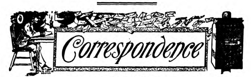
NOTICE TO SECRETARIES.

The statistical position of the metal remains excellent, and will probably show a further improvement at the end of this month as a result of labor disturbances at the refinery of the Nichols Copper Co. Nevertheless, consumers remain rather indifferent, both on this side and in Europe, particularly with reference to covering their future requirements. As in all other industries, manufacturers have been exceedingly busy on old orders, but complain that new business shows a large shrinkage. The close is undecided at 143/4@15c for lake; 14.65@14.75c for electrolytic in cakes, wirebars or ingots, while casting copper is quoted nominally 14.45@14.50c as an average for the week.-Engineering and Mining Journal, June 21, 1913.