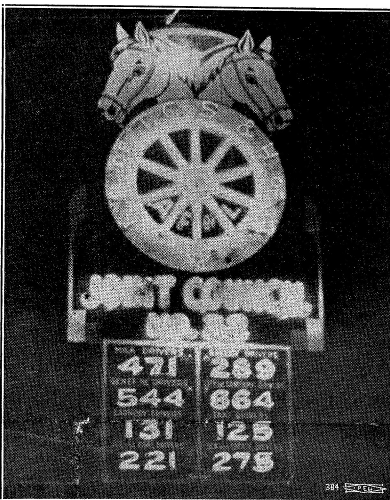
Sign by Kaufman Outdoor Advertising