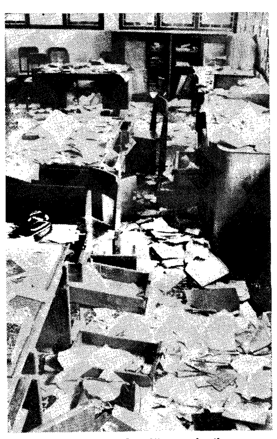
The ransacked offices of the General Association of Overseas Chinese Organizations in Medan, North Sumatra,