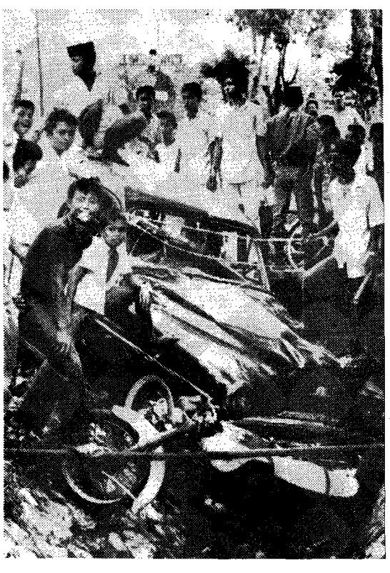
May 27, 1966