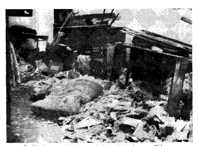
Inside the wrecked home of Yang Hung-tang, a Chinese national living in Tandjung Priok Port,