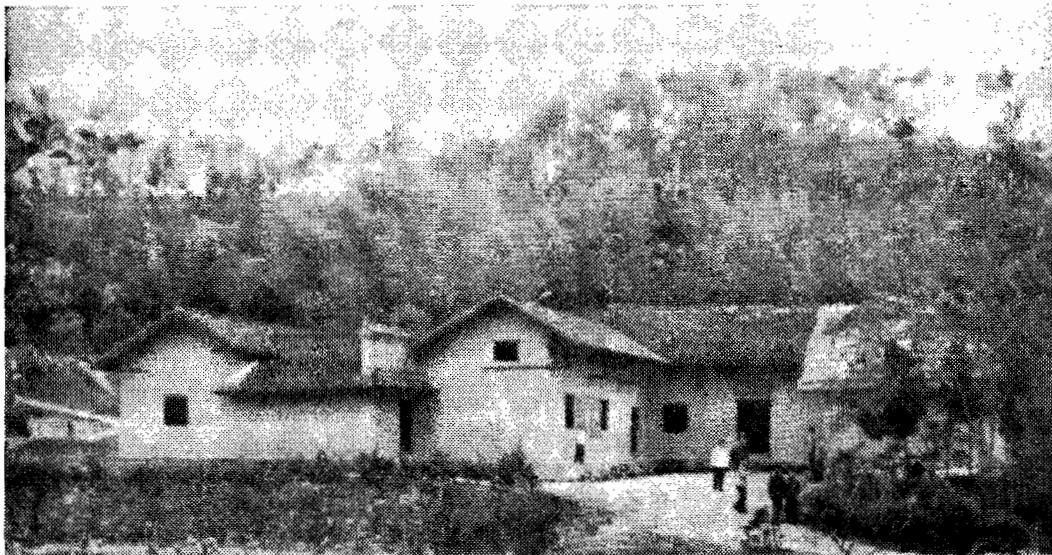
Chairman Mao's birthplace

picked stones at places where Chairman Mao had worked, and wrapped them up as souvenirs. When visiting the house of Chairman Mao which is part of the museum, some, with tears streaming down their cheeks, stood silent before the photographs of six martyrs in his family. On the way back to Changsha, many foreign friends lustily sang The East Is Red, A Ship Can't Sail Without a Helmsman and other songs. Back at the guest house, some foreign friends looked at the Hunan embroidery work Shaoshan on a big screen and said, "Every time I see this, I receive new encouragement."