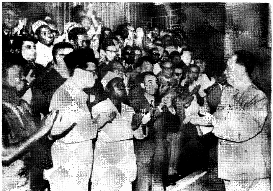
The delegates and observers greet Chairman Mao