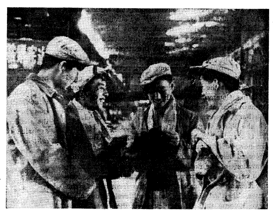
Revolutionary workers of the First Steel Works at the Anshan Iron and Steel Company, having fulfilled the production quota of the last year ahead of schedule, conscientiously sum up their experience and are resolved to win even greater victories in the new year.

tsin, declared: We dockers shoulder glorious tasks. Working in the harbour and bearing in mind the whole country and the whole globe, we'll firmly grasp revolution and energetically promote production and deal hard blows to imperialism, revisionism