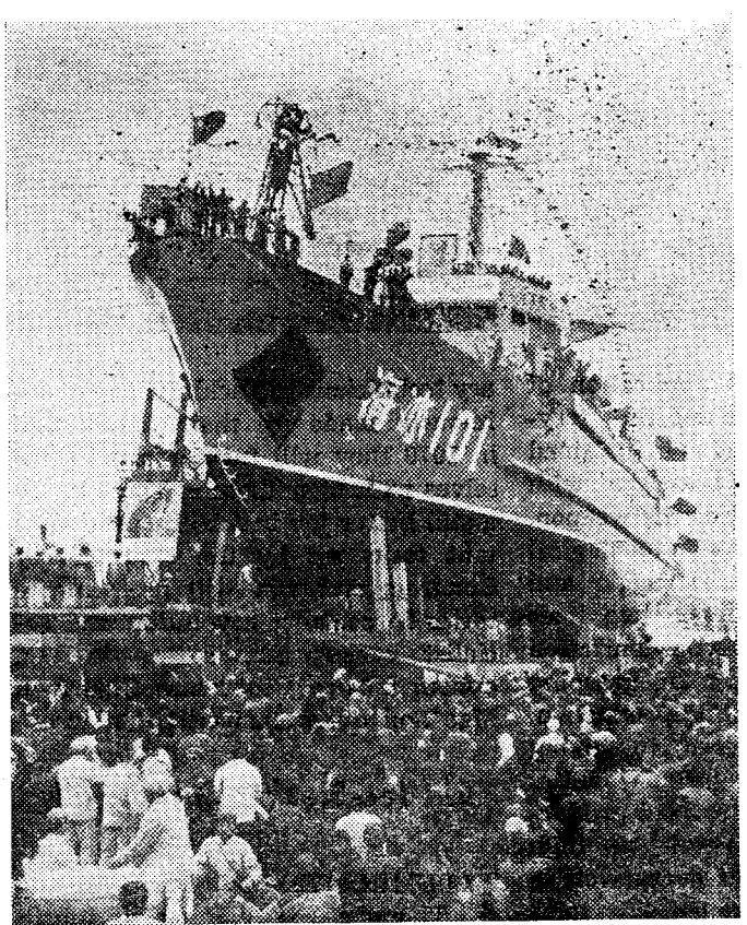
The big 3,200-ton Haibing 101, the first Chinese designed and built ice-breaker, successfully launched in Shanghai.

main force, and revolutionary cadres and technicians. Designing and building took place simultaneously, with the former being accomplished in a little over a month.