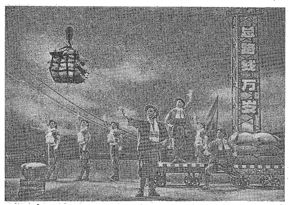
Dockers led by Kao Chih-yang (centre) moving foreign-aid seed rice.

When the curtain rises, the dockers are busy moving seed rice for shipment to Africa. Because of an approaching typhoon, the freighter will leave port ahead of time. There are still 8,000 sacks to be loaded. In addition, 2,000 sacks of export wheat that had been left out in the open have to be moved into the warehouse.