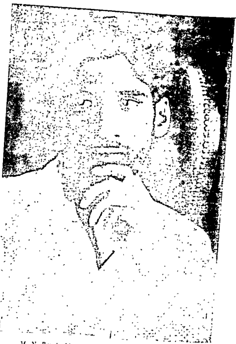
M. N. Roy in Moscow during the Second CI Congress