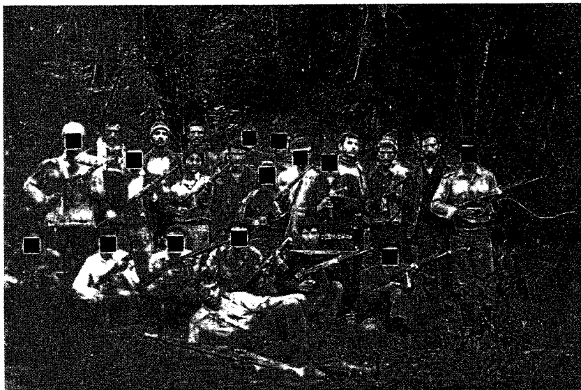
Heroic fighters of Sarbedaran in the jungles of northern Iran.

happened. Our plan was to start the uprising in a section of Tehran by relying on the military force of our organisation to seize a district, immediately arm the advanced and revolutionary masses, develop branches of revolution in other areas, direct the masses to take over the principal centres of power and reaction in Tehran, overthrow the Islamic Republic and establish a revolutionary provisional government. For this reason, we chose the Fallah section of Tehran, positioned our military force and made the necessary technical and political requirements. Considering there might be obstacles in implementing the plan in Tehran, we chose the city of Amol as an alternative for starting the uprising. Proper directions were given the Amol organisation. As the preparation period was prolonged, conditions in Tehran became unsuitable to begin the uprising, and, especially given the quantity of our forces, it became impossible there. In Amol too a broad offensive by the military and