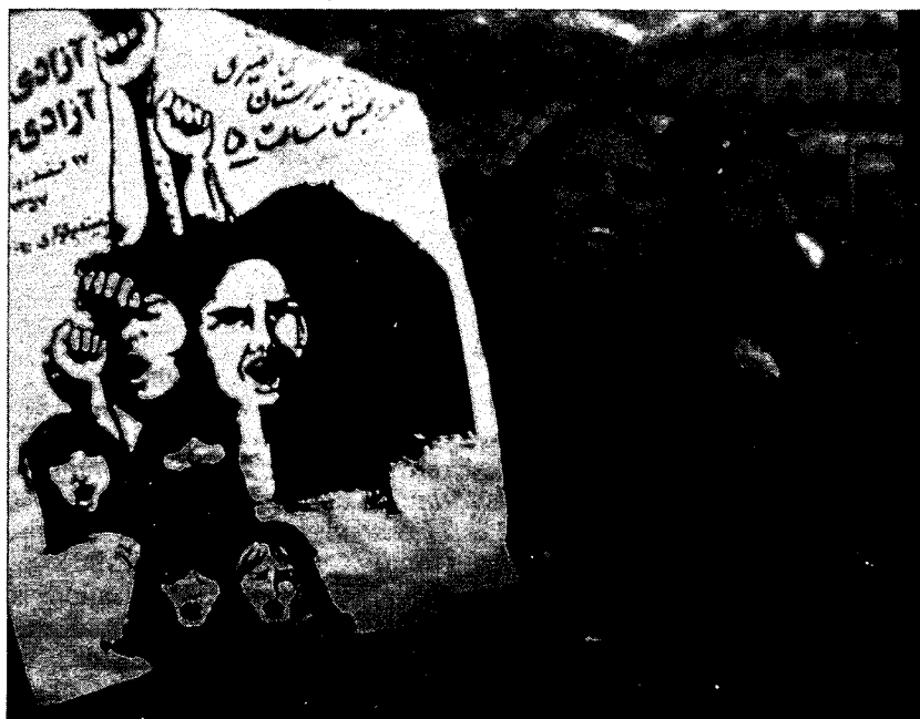
March 8th demonstration in Teheran in 1979.

It has been more than a century that the world proletariat in its battles against the bourgeoisie for communism has accumulated rich and bloody experiences—experiences which include victories and defeats, revolutionary advances and retreats of the proletarian batallions in different countries of the world, experiences which have been paid for in blood, experiences in which the proletariat in advancing its aims has learned lessons from and has enhanced its knowledge of making revolution and building socialism. Each lesson learned has always passed through a hard battle bet-