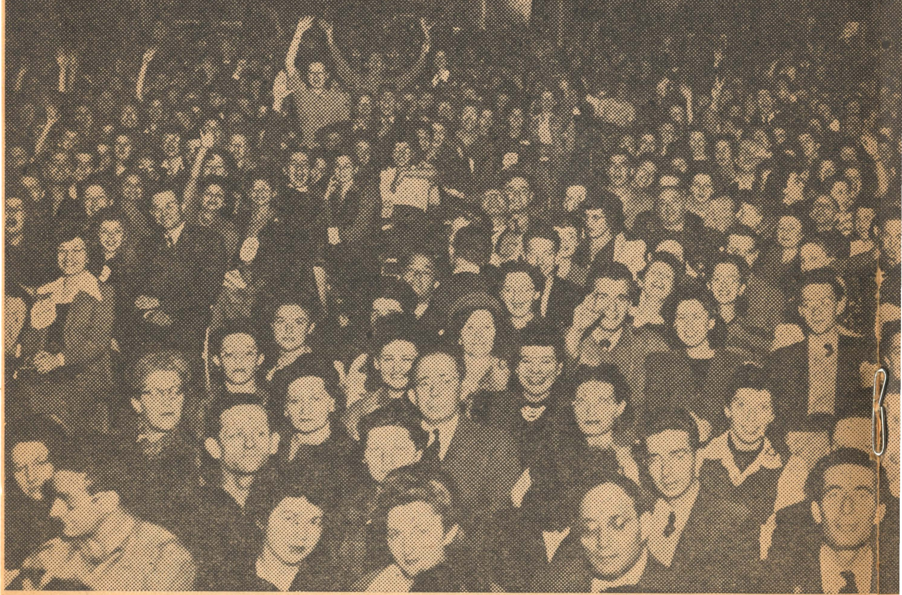
Five thousand youth at Manhattan Center, in New York Ci