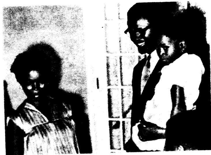
With the family.

The catastrophic state of the Congo's public health service was a consequence of colonialism. Poverty, chronic malnutrition and lack of effective medical care promoted the spread of serious diseases, causing a very high mortality rate, especially among children.