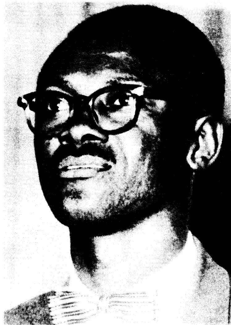
Patrice Lumumba was one of Africa's first outstanding national democrats. His world outlook was not devoid of eclecticism; it contained elements of petty-bourgeois ideology, of the teachings of the Utopian Socialists, and of the ideology of early bourgeois society in Africa. Yet we cannot but agree that he was an honest and consistent revolutionary, a democrat and an anti-racist. He denounced neo-colonialism.

"No Congolese will ever forget that independence was won in struggle, a persevering and