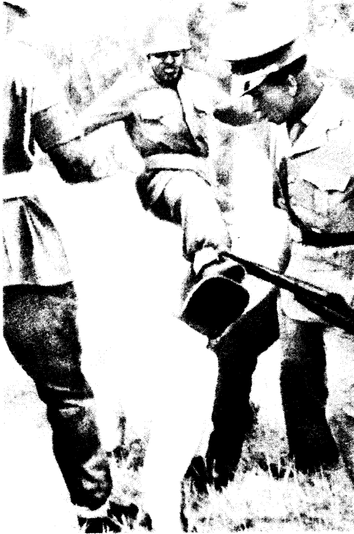
Brutal treatment of Lumumba's supporters.

country, I have never doubted for a single instant the final triumph of the sacred cause to which my companions and I have devoted all our life. All we wanted for our country was its right to an honourable life, to unstained dignity, to independence without restrictions. This was never desired by the Belgian imperialists and their Western allies, who found direct and indirect support, both deliberate and unintentional, amongst certain high officials of the United Nations, the organization in which we placed all our trust when we called on its assistance.