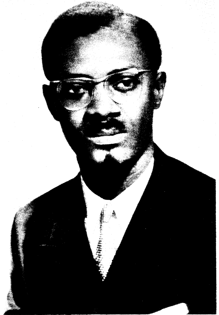
For millions of people in Africa and other continents, Patrice Lumumba remains a symbol of patriotism, love of freedom and fortitude in the national liberation struggle.