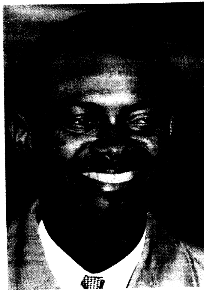
The sovereign Republic of the Congo was proclaimed on June 30, 1960. As head of the first national government, Patrice Lumumba saw to it that its policy was purely the policy of the people. Though he did not manage to complete the government programme he was drawing up, the theses and materials he prepared give us good reason to conclude that he recognized the need for the struggle for political independence to develop into a struggle against exploitative relations.

The Round Table Conference ended with the victory of the Congo's progressive forces: it endorsed June 30,