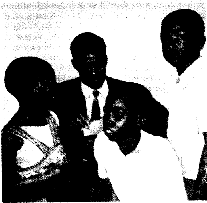
Being very fond of children, Patrice Lumumba dreamed of a bright future for them.