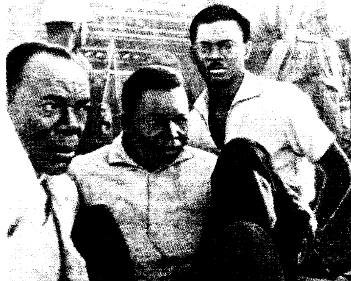
Prime Minister Patrice Lumumba with his closest associates, Maurice M'polo and Joseph Okito, before being sent to Thysville prison.

It is well known that the Katangan authorities concocted a cheap detective story about the escape of