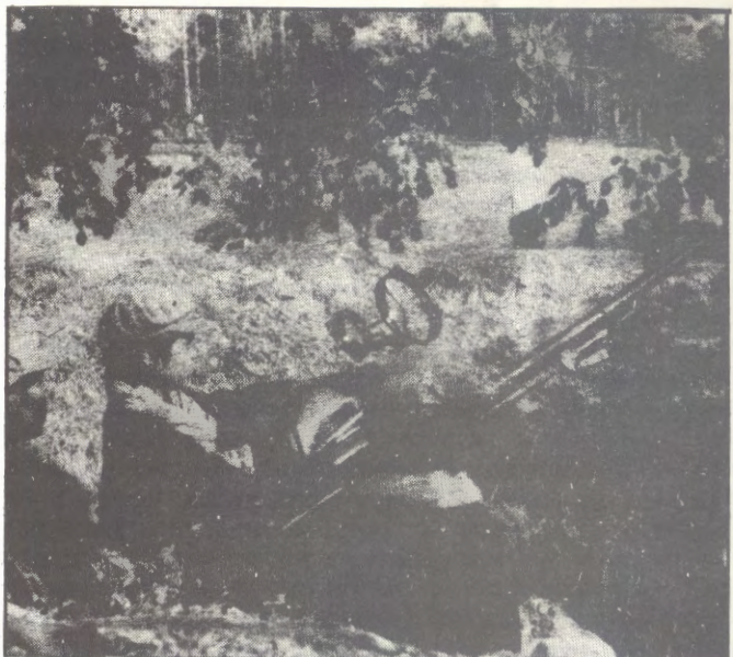
The Revolutionary Army of Kampuchea will defend their country's independence from all aggressors.

thought that Kampuchea could not liberate itself and held our people in great contempt...They asked us to cooperate with them in foreigh affairs. We told them we want to preserve our independence".