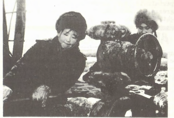
Women in China have the right to take jobs in all spheres of the economy - these oil workers prove that women are quite capable of doing work traditionally seen as men's.

The two parties are different - they have different ways of trying to get the working class and working people generally to accept capitalist exploitation and oppression. They are two wings of a single bird of prey. But with their different voices, each speaks for the ruling class. The capitalist class has no interest in ending the oppression of women and could not do so anyway. For that it needs a different social system, socialism, to take the burden of household drudgery from women by providing cheap laundries, sewing and mending services, canteens and take-aways, good child-care facilities and full employment for men and women. The profit system cannot do this, not because it is technically or administratively difficult, but because it pays the ruling class to leave women as they are and to try to use all differences to divide the working class. We need genuine reforms which lessen women's oppression and help them take part in the struggle for socialism. But even for these we have to fight every inch of the way - neither capitalist party has any free gifts to offer.