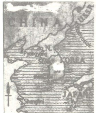
Bordering the Soviet Union and China and facing Japan, Korea has great strategic significance.

However, after the war the US imperialists became hell-bent on world domination and turned the spearhead of their attack against the newly emerged socialist camp. South Korea thus became part of its 'frontline against communism' - particularly after the liberation of China in 1949. The US proceeded to rig up a fascist state in South Korea and to build up a puppet regime using all the old collaboraters of the Japanese colonialists.