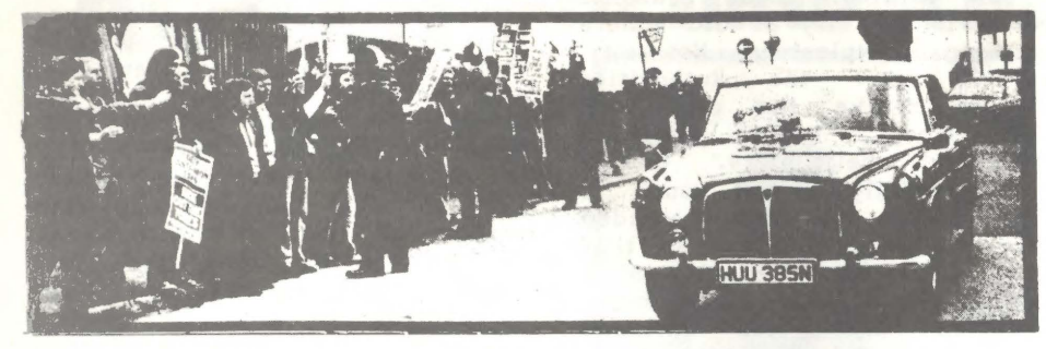
Weed bouquet lands on bonnet of Thatcher's car