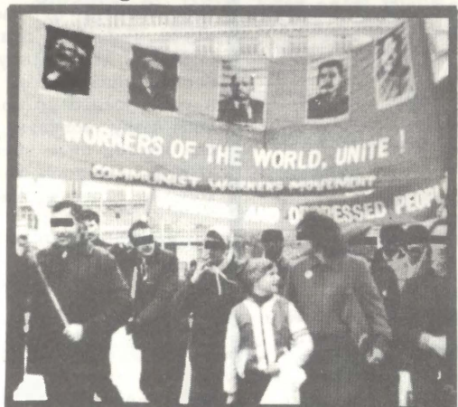
INTEGRATING THE ORGANISATIONS

As we thrashed out the three main issues that still divided us, we learnt a great deal from each other and reached a common understanding of these questions that was better than either organisation had managed on its own.