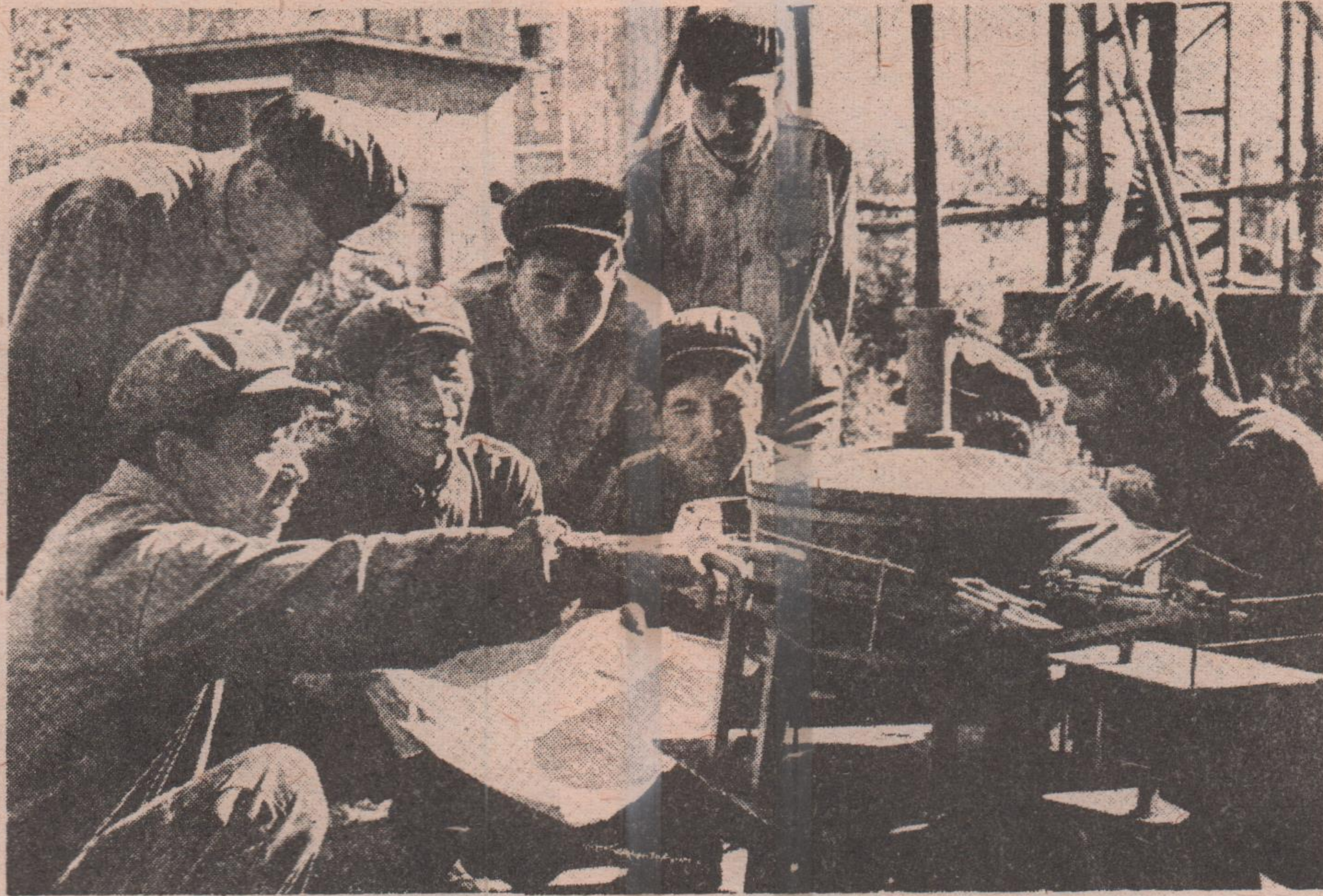
A technical innovation shock team studying improvements on a new type of heating furnace.