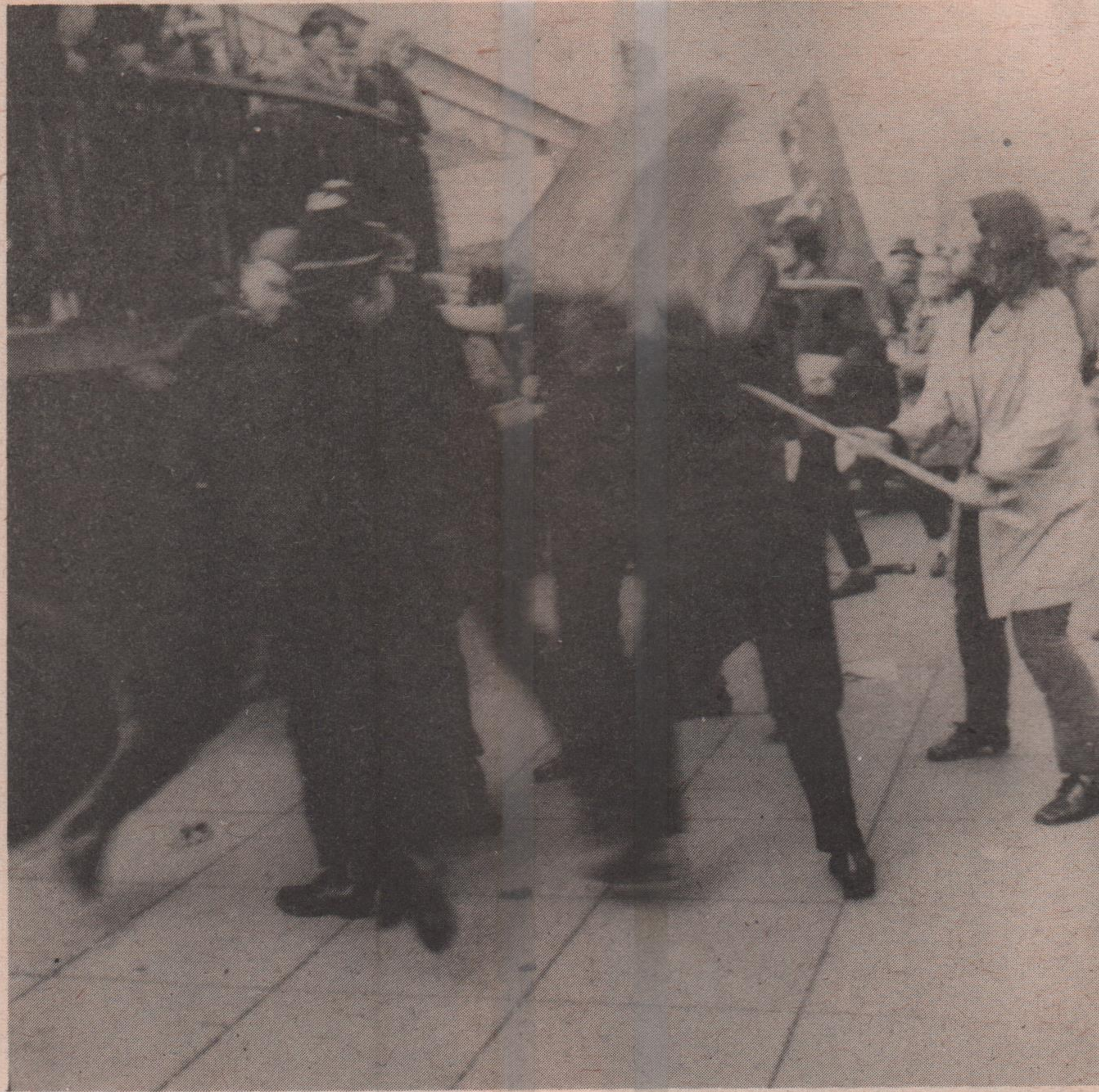
Lackey police cower before Red Flag as demonstrators resolutely counter their fascist attack on March 27th demonstration. On April 23rd the March 27th Committee picketed the court in support of the twelve people unjustifiably arrested by the fascist police.

"We have been charged with 'threatening behavior likely to cause a disturbance of the peace', 'assault' and 'malicious wounding with intent to do grievous bodily harm'. Now exactly who is guilty of these offences? The demonstration was taking place in a calm and enthusiastic atmosphere with the support of the vast majority of the people present. Did not the police threaten and disturb the peace of the Bull Ring by their attack? Five or six police wantonly attacked each of the demonstrators. Did not the police then commit assault? Several people were viciously attacked in the cells by police chanting Sieg Heil. Did not the police maliciously wound with intent to do grievous bodily harm? Yes, of course they