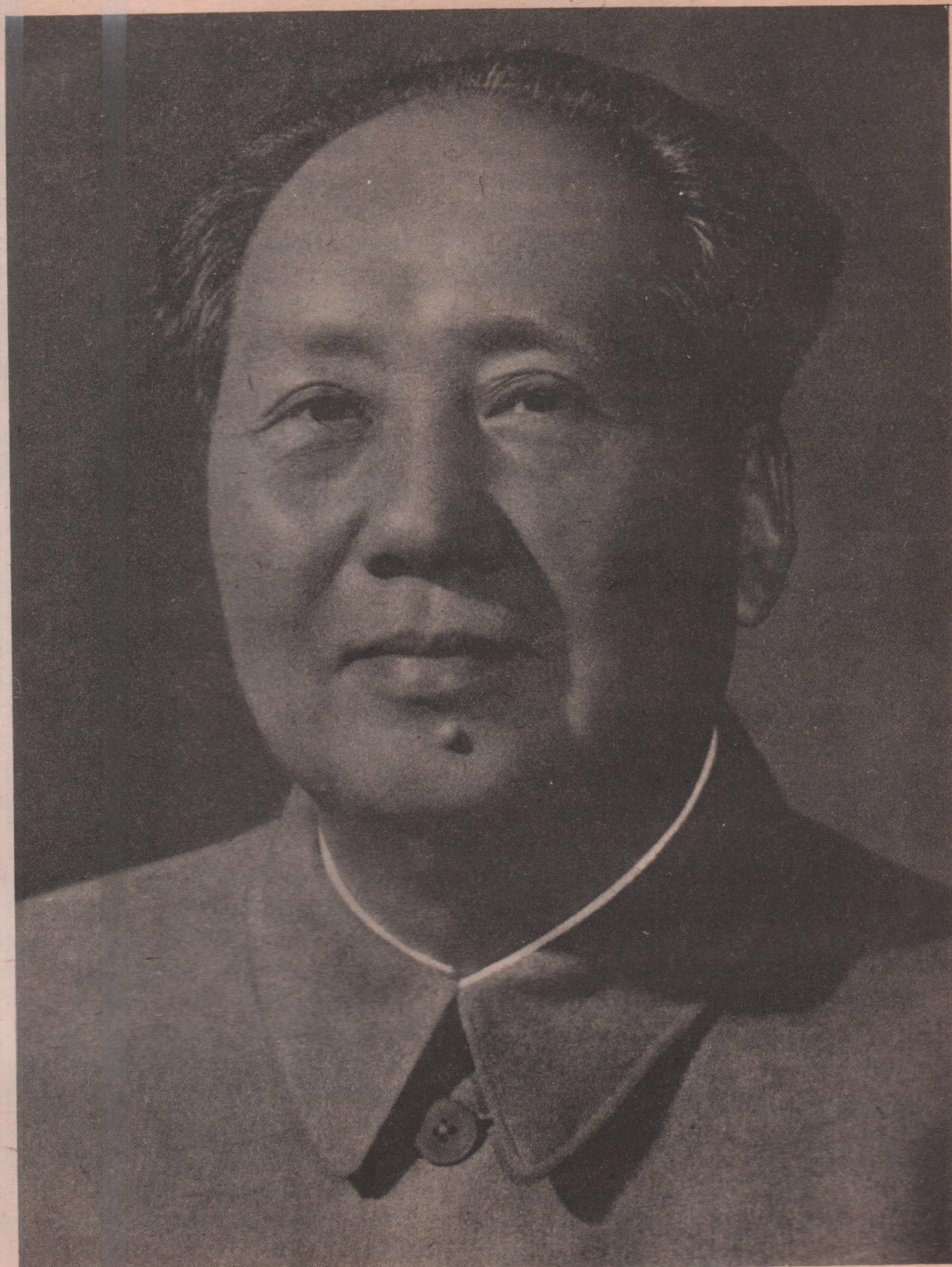
Our most respected and beloved great leader and great supreme commander Chairman Mao.