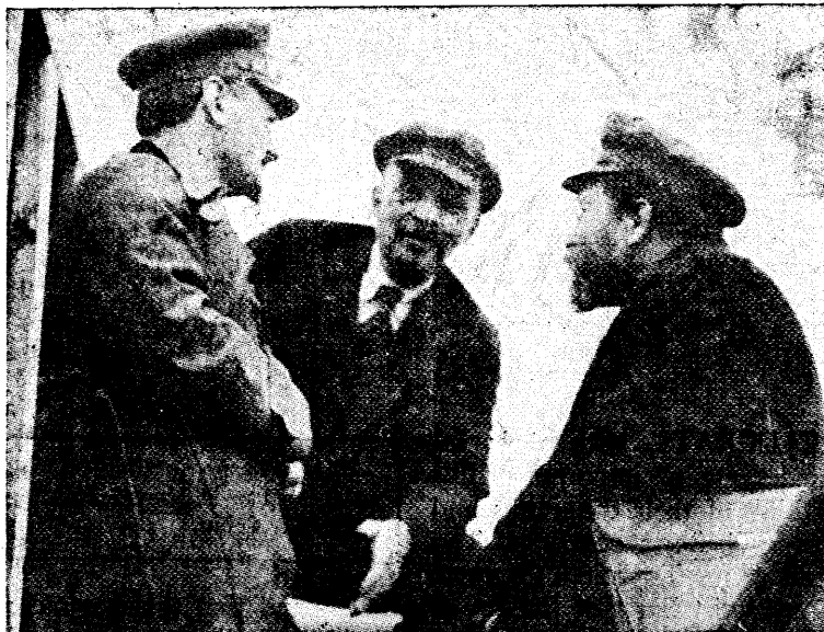
Three of the Bolshevik leaders who founded the Soviet Union. Trotsky (left) was assassinated by an agent of Stalin in 1940. Lenin (center) died in 1924 and was converted into a "harmless ikon" by Stalin who sought to rule in Lenin's name. Kamenev (right) was framed-up by Stalin in the infamous Moscow Trial of 1936 and shot as a "fascist mad dog."

Trotsky offered to appear before an impartial commission of prominent liberals and labor figures. Such a commission was formed under the chairmanship of the world-famous philosopher and educator John Dewey. In