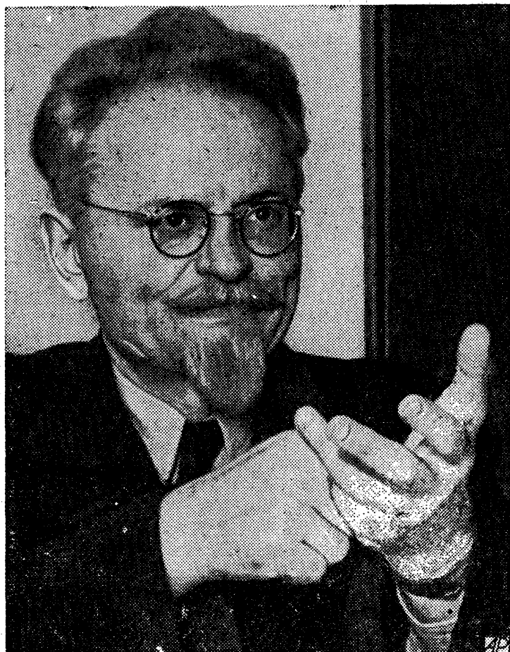
Outstanding leader of the 1905 revolution in Russia, co-leader with Lenin of the October revolution that founded the first workers state, Leon Trotsky devoted the last years of his life to defending the Soviet Union from imperialist pressure and Stalinist degeneration. He was slandered, framed-up, hounded from country to country and finally murdered by Stalin. Now the end of the Stalin cult signals the beginning of the victory of Trotsky's program of revolutionary socialism.