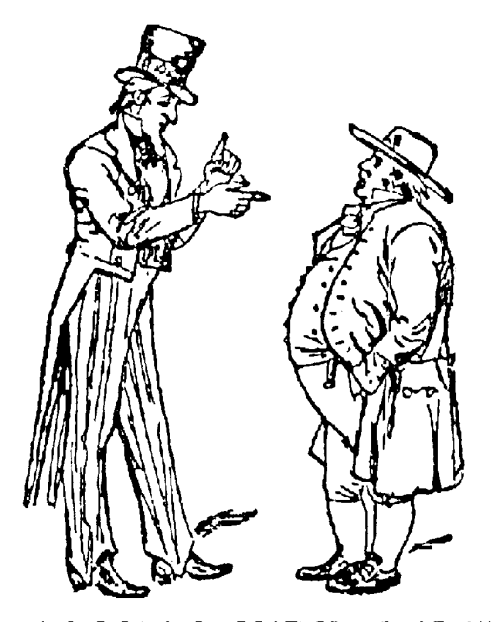
UNCLE SAM & BROTHER JONATHAN