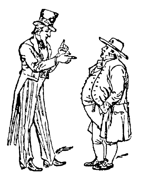
UNCLE SAM & BROTHER JONATHAN