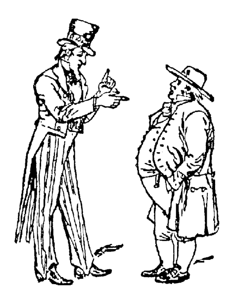
UNCLE SAM & BROTHER JONATHAN

and troops to oust the present possessors without further ado: they will put their acts upon a legal basis, otherwise their example of violence would instigate the most violent passions from their own camp-followers; that might be found difficult to curb. I know that Socialists seek the most peaceful solution possible; they are not going to set the example or give a color for violence; eh?