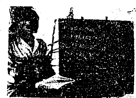
Education in the field in Mozambique went hand in hand with the struggle for national liberation.

flation, which in Nigeria is running at about 40 percent. And there is an enormous gap in wages. So you really can't fool the people who are being oppressed about whether you have a new society. It is the intellectuals who get fooled... What we have happening in Africa now is that there are changes coming from below. It's been a long time since imperialism was overthrown. Very soon it will be 20 years since Nigeria got independence, so the argument that we are being held back by the foreigners will soon start to make no impression on the people. I think we are entering the period where what will happen in Africa next will be mass and class-oriented. Maybe the revolution people have been talking about will actually begin to happen.