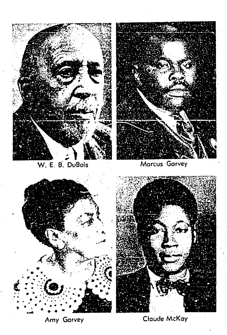
"Back in 1920, when nationalism among Black people first took its roots, the U.S. government tried to suppress the propagation of radical ideas that the Russian Revolution, which had just taken place three years before, in 1917, had instilled in Black people in this country. But small groups of Black radicals retaliated to the government's attack by publishing