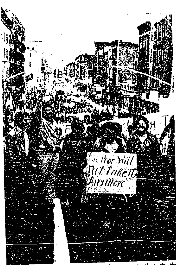
Latino students and community residents march through the street; of the South Bronx in New York in 1978, showing support for the takeover of Hostos Community College and demanding the City halt education cutbacks. 5344