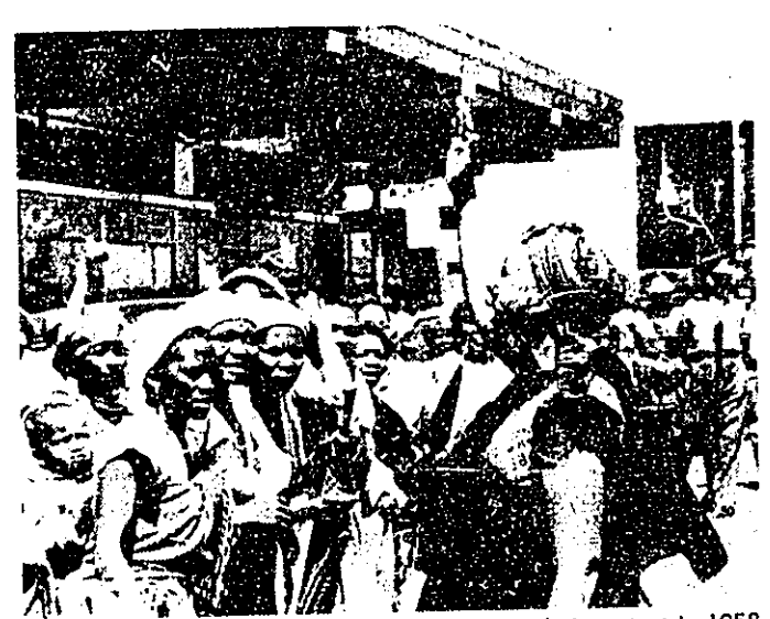
Many of these women were arrested following their protest in 1958 against South Africa's apartheid posicy of demanding that women carry identification passes.

Consciousness and the first mass opposition to apartheid to break into world view since the Bloody Sharpeville massacre of 1960, when thousands of Africans shouted "Izwe Lethu," burned their passes, and marched to the police stations demanding to be arrested for having violated the apartheid rules. The unarmed mass of men, women and children were machine-gunned, a state of emergency was declared, and any political organization daring to challenge white supremacy—such as the ANC and PAC—was outlawed at once. Soweto is the proof that arms not only cannot kill the idea of freedom, but that the struggle also embraces ever newer layers of the population.