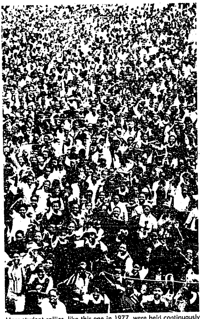
Mass student rallies, like this one in 1977, were held continuously by Soweto students in opposition to apartheid South Africa educational policies.