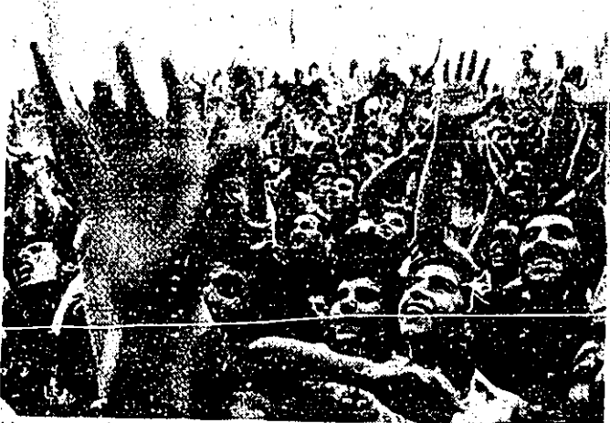
Huge crowd in Algeria welcomes released political prisoners on the eve of winning independence from French colonialism in 1962.

See Sexism, Politics and Revolution in Muo's Chino by Raya Dunayevskaya (Wamen's Liberation, News and Letters, Detrait, 1977), especially the interview with the Chinese refugee thong Kong, who speed's of the frustration and anger of the Chinese students at Peking University when university afficials blocked their attempts to socialize with the African students and learn from them about the African revolutions.