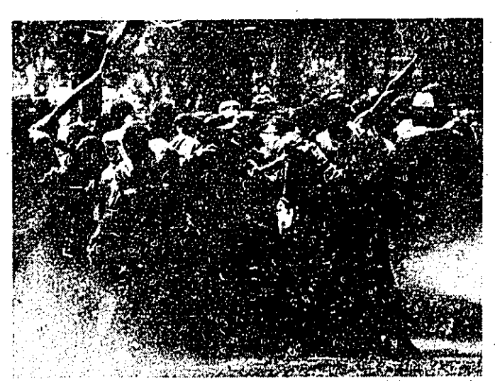
Black youth demanding equality in Birmingham, Alabama, withstand full force of fire hoses turned on them during demonstrations in 1963.

the walls of segregation and discrimination. The fundamental separation between King and the older Civil Rights organizations was just this recognition of masses in action as power. It was this and not the discovery of a "new and powerful weapon, non-violent resistance" that made him a leader.