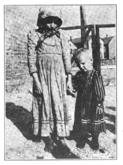
This "Little Mother" of Six Other Children Has Neither Shoes, Stockings, Nor Underwear.