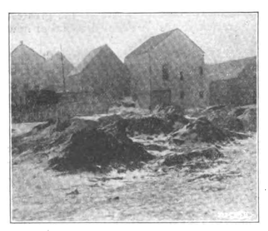
An Unsightly and Unsavory Garbage Dump "Back of the Yards."

From its inception the Stockyards Labor Council proceeded on the theory that success in organization work depends almost wholly upon the strength and intelligence of the organizing force. It scorned the idea that any workers are "unorganizable," con-