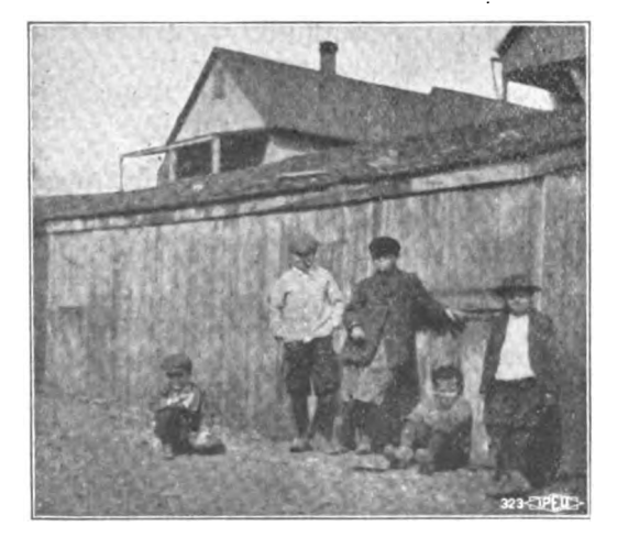
The Vicious Environment Is a Fertile Breeding Place for Youthful Crime.