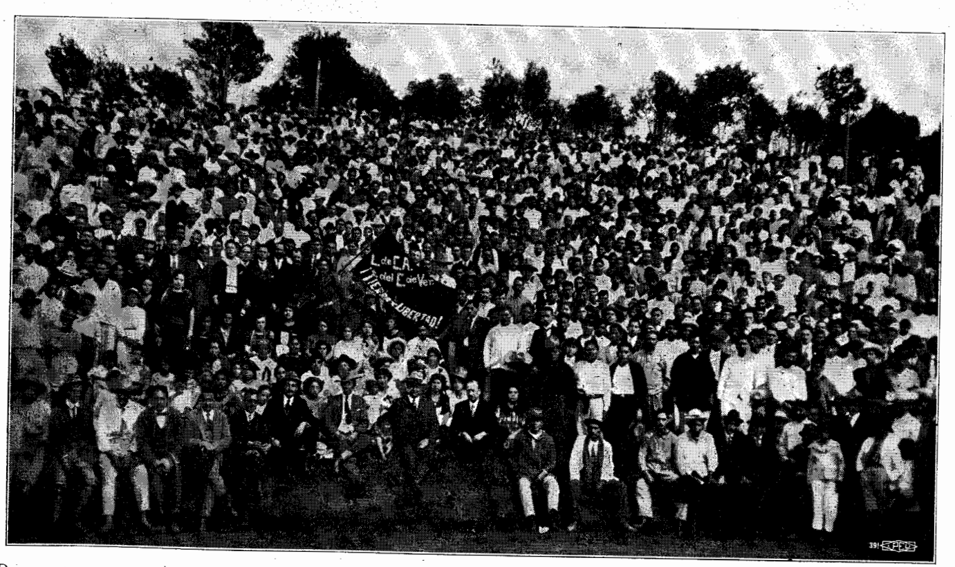
Delegates of the Agrarian League of Communes of the State of Vera Cruz, Mexico, at the Second Con-GRESS NOVEMBER 28 TO DECEMBER 3, 1924, WHO VOTED FOR AFFILIATION TO RED PEASANTS INTERNATIONAL