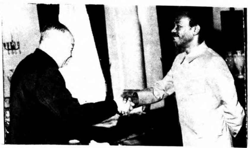
... receiving the departing Ambassad or of the People's Republic of China,