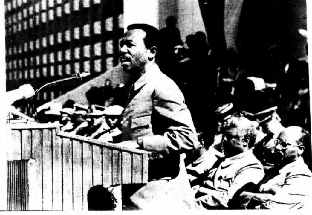
There can be no force to stop us from attaining all our desired goals if we work hard and struggle with resoluteness." -- Comrade Mengistu Haile-Mariam addressing the nation from Revolution Square