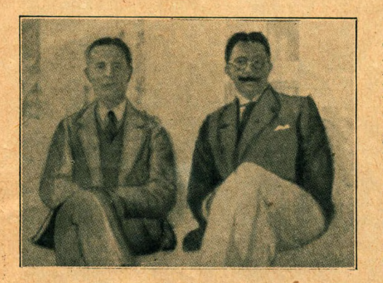
Firestone and Ex-President King in conference over the sell-out of Liberia

This agreement was completed in 1925. Since then, Liberia has become an economic colony of American imperialism; and the peasantry, the slaves of the Government and the Firestone Co.