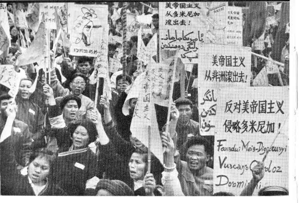
Representatives of minority nationalities visiting Peking shout: "People of the whole world, unite and overthrow U.S. imperialism!"