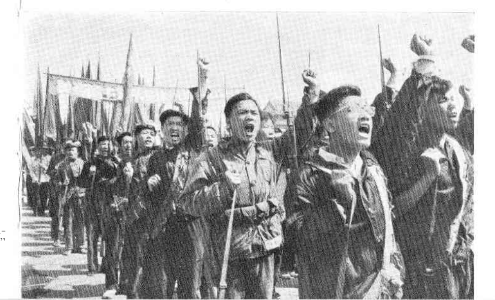
Peking militia angrily shout: "U.S. imperialism, get out of all places you have invaded!"