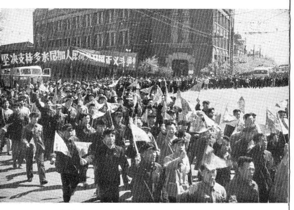
The workers of Shenyang cry: "U.S. imperialism, get out of the Dominican Republic!"