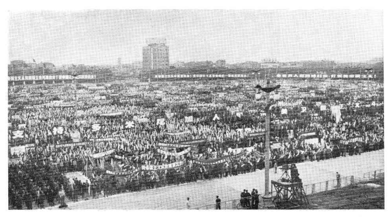
The huge rally in Shanghai in support of the Dominican people against U.S. aggression