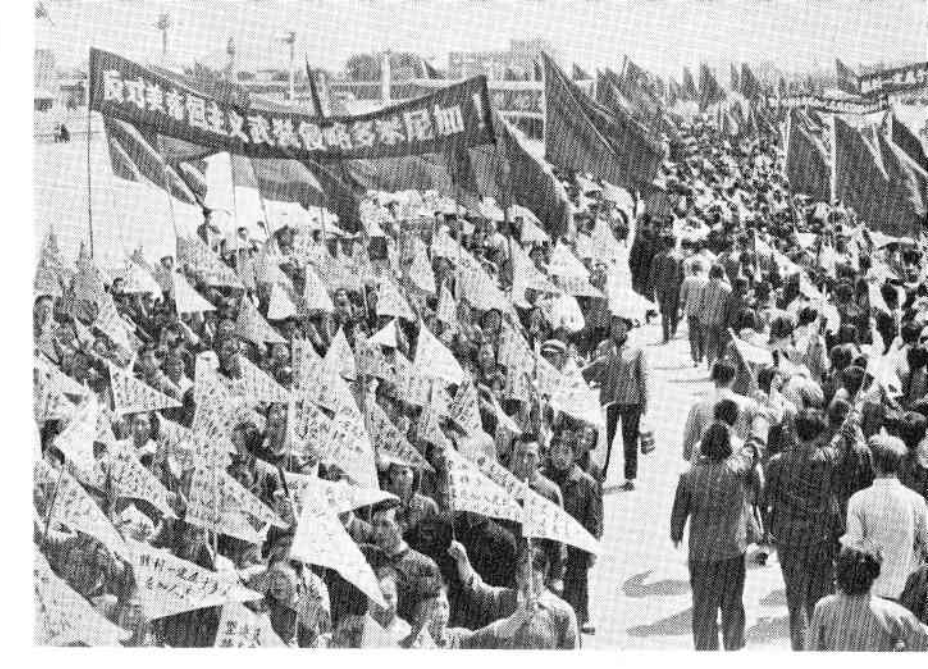
Hundreds of thousands of demonstrators march through Peking