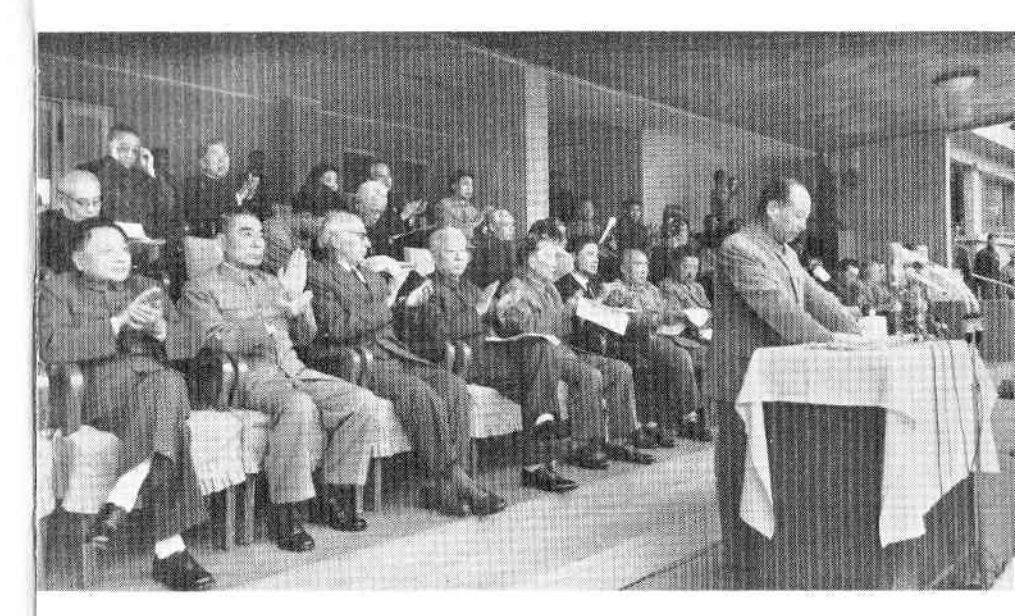
The mass meeting is addressed by Peng Chen, Member of the Political Bureau of the Central Committee of the Communist Party of China and Mayor of Peking

A mammoth mass rally was held in Peking, on May 12, 1965, in support of the Dominican people's resistance to U.S. armed aggression