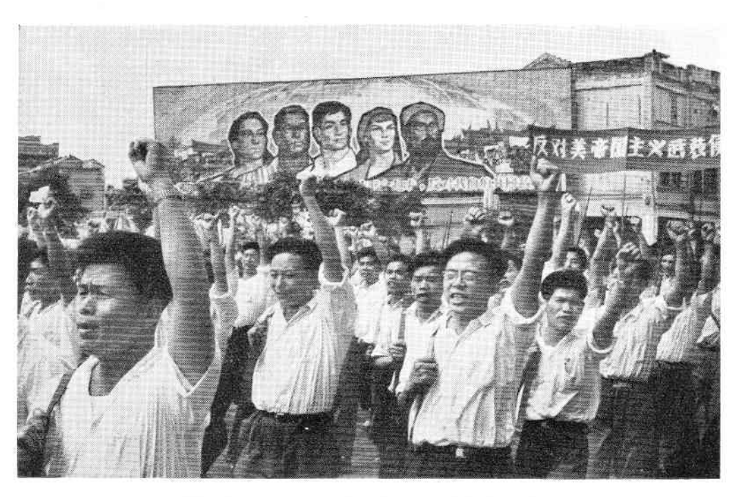
"The Dominican people will win, U.S. imperialism will be defeated!" shout the people of Canton \,