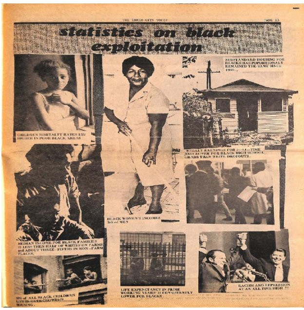
Figure 1. "Statistics on Black Exploitation," Inner City Voice, February 1971.

Since the extension of democratic rights did not solve the social or economic problems affecting the masses of black people, the Panthers and the League concluded that the problem lay with the economic structure of society. Eldridge Cleaver, Minister of Information and spokesperson of the Black Panther Party, explained the cause of the continued deprivations in the black community: