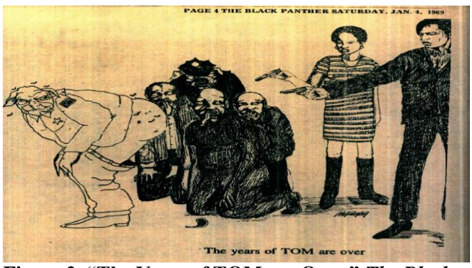
Figure 2. "The Years of TOM are Over," The Black Panthers Saturday, 4 January, 1969.

In response to the pressure of militant organizations and the mass movements, presidential-hopeful Richard Nixon utilized the black power slogan to promote black capitalism and minority businesses.<sup>22</sup> For Nixon, it was a question of integrating the black middle-class and quelling the threat of urban black rebellions.<sup>23</sup> For the League and the Panthers, this was an attempt by Nixon to "torpedo the black liberation struggle by buying off the black bourgeoisie...who are satisfied with crumbs from the master's table."<sup>24</sup> Huey wrote that, "as far as the masses are concerned," black capitalism "would be trading one master for another," and be a "cruel hoax." The black bourgeoisie were unable to play a revolutionary role because they found themselves in a contradictory position. On the one hand, they wanted to "eliminate racism in order to enhance their prospects," but on the other hand, "racism cannot be eliminated until capitalism is eliminated," and so the black bourgeoisie's interest in black liberation conflicted with their class interests.<sup>25</sup> It was this conclusion, that the middle-class could not lead the struggle for black liberation, that led the Black Panther Party and League of Revolutionary Black Workers towards the black urban proletariat and underclass.